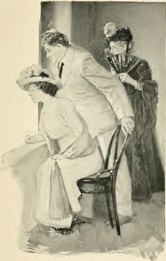
FROM THE TWO AVAILABLE WINDOWS OF THE "MAIL" OFFICE, THREE PERSONS, AS EAGER AS THE MOST EAGER CHILD, WATCHED THE GATHERING CROWDS, AND WAITED FOR THE FLOWER PARADE.