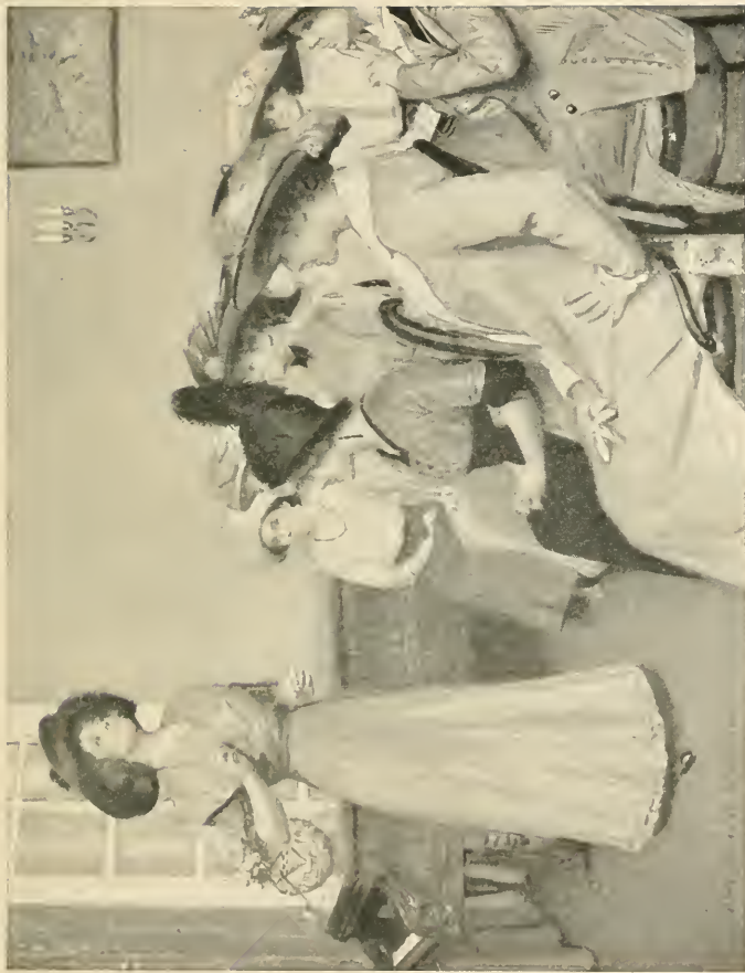
HER VOICE HAD GROWN LESS DIFFIDENT, AND RANG WITH SUDDEN LONGING AND APPEAL.