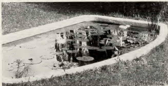
A concrete or stone pool can be made any size in a variety of beautiful shapes.

A very satisfactory water garden can be made of a large, clean, wooden tub , or the bottom section of a barrel or hogshead, about two feet deep, set into the ground with the rim about flush with the surface. (See Fig. 1.) Often several