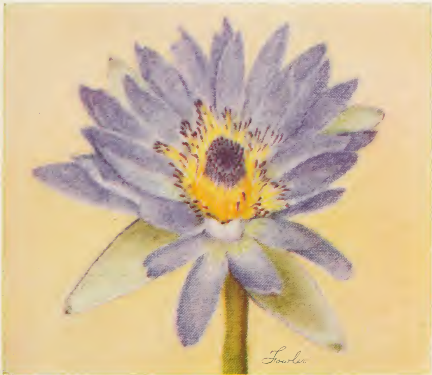
Fig. 6— N. Pennsylvania . A tender day-blooming lily. Beautiful large blue flowers, exquisite perfume (see p. 14).