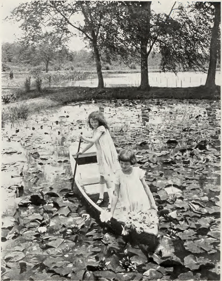
A corner of one of the nine acres of beautiful lily ponds at Shaw's Aquatic Gardens.

THE W. B. SHAW AQUATIC GARDENS KENILWORTH, WASHINGTON, D. C.