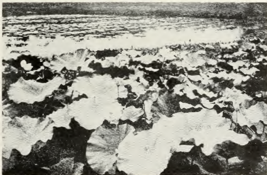
A pool of Egyptian Lotus

NELUMBIUM SPECIOSUM (EGYPTIAN LOTUS): The easiest of all Lotus to grow. The large flowers are a deep rose color, shading to cream at base of petals. (See Fig. 7, p. 15.) Dormant tubers..... $2.00 ea.