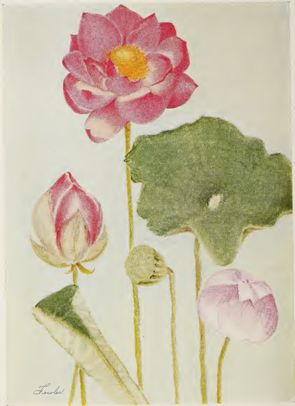
Fig. 8— Nelumbium Roseum Semiplenum , another strong, free-flowering lotus (see p. 19).