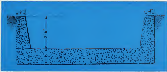
Fig. 2—This diagram shows the proper shape and thickness of sides and bottom for stone and concrete pools.

Excavate to a depth of two feet six inches, and tamp the soil until firm and level. This is the time to install any drain, overflow and supply pipes you may wish to use, by setting them in place and later casting the concrete around them. Fill in the bottom with a concrete mixture, using one part water-proof Portland Cement, two parts sharp clean sand, and three parts two-inch stone.