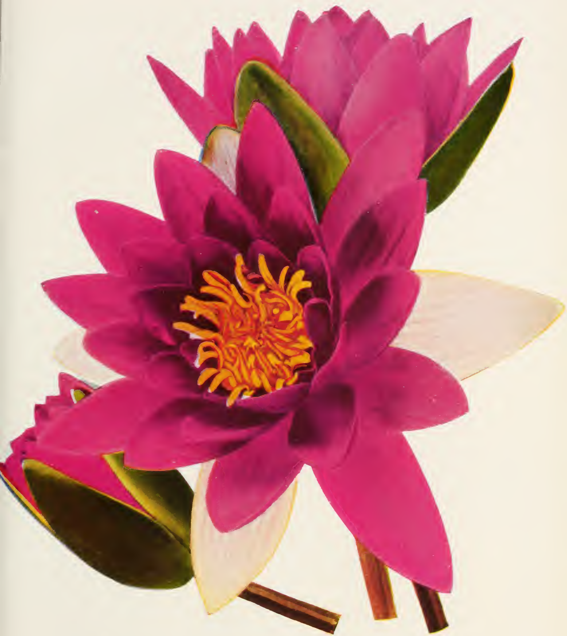
Fig. 5—N. Attraction—A magnificent hardy lily, spectacular and free blooming (see page 12).