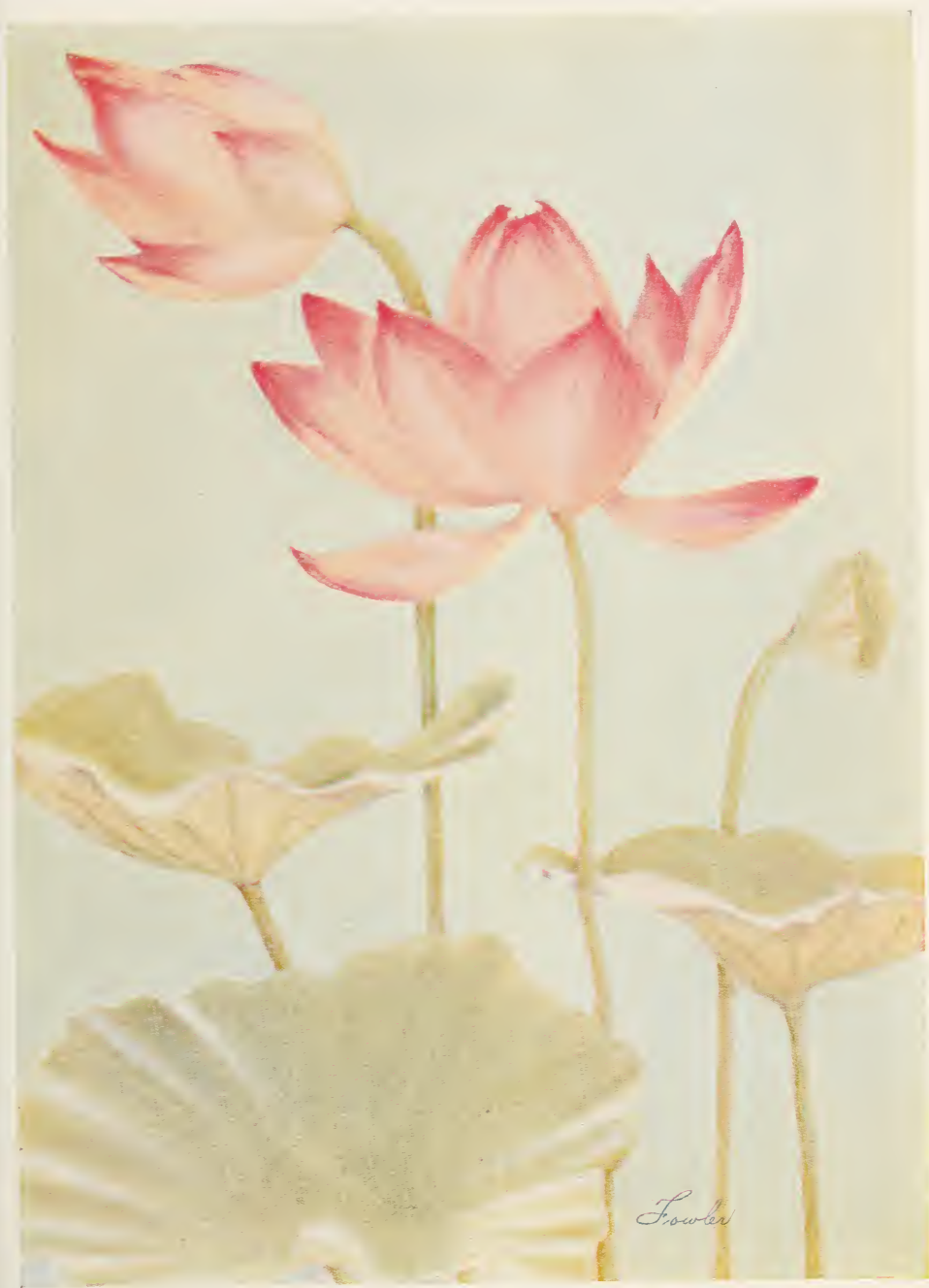
Fig. 7—Egyptian Lotus (Nelumbium Speciosum) a beautiful free blooming variety (see p. 17).