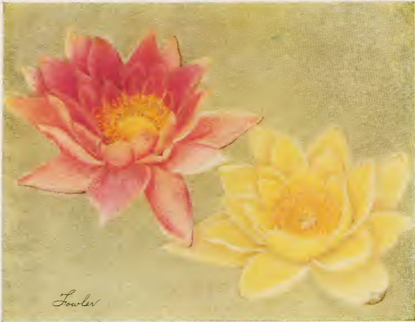
Fig. 4— N. Robinsoni , a beautiful orange red, and N. Marliacea Chromatella , a large non-changeable yellow (see p. 9 and 10).