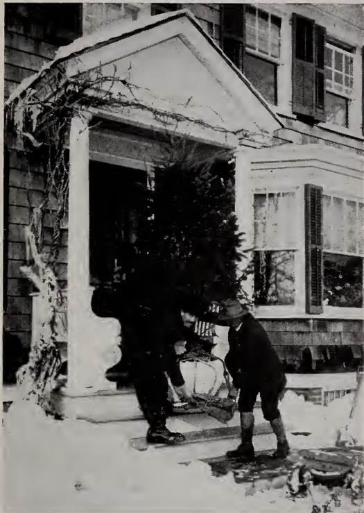
Bringing in the Christmas tree. Set in a box or tub without removing the burlap and water like a potted plant.