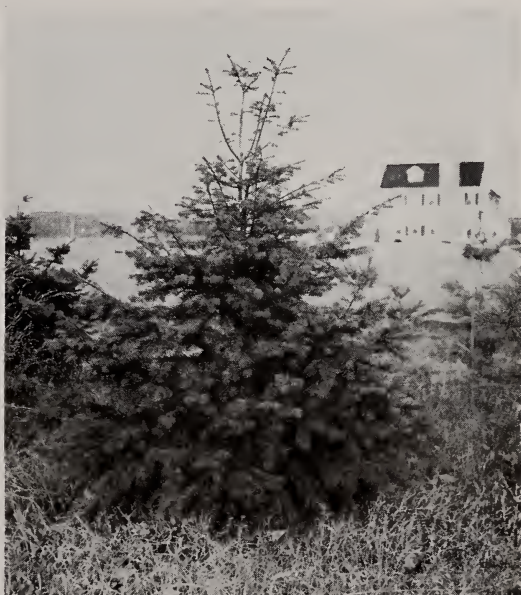
Douglas Spruce. Last year's Christmas tree, still a pleasant memory.

Did you buy a live Christmas tree last year and plant it after the holidays? We recommend White Spruce, Douglas Spruce, Colorado Spruce, and Nordmann's Fir. See page 5 for prices. Place your order now and we will have the trees ready when you call to take in your car, or we can deliver if you prefer. Customers from a distance should allow ample time for transportation. Trees up to 5 ft. for shipment will be securely crated at $.50 extra. See page 5 for mulching.