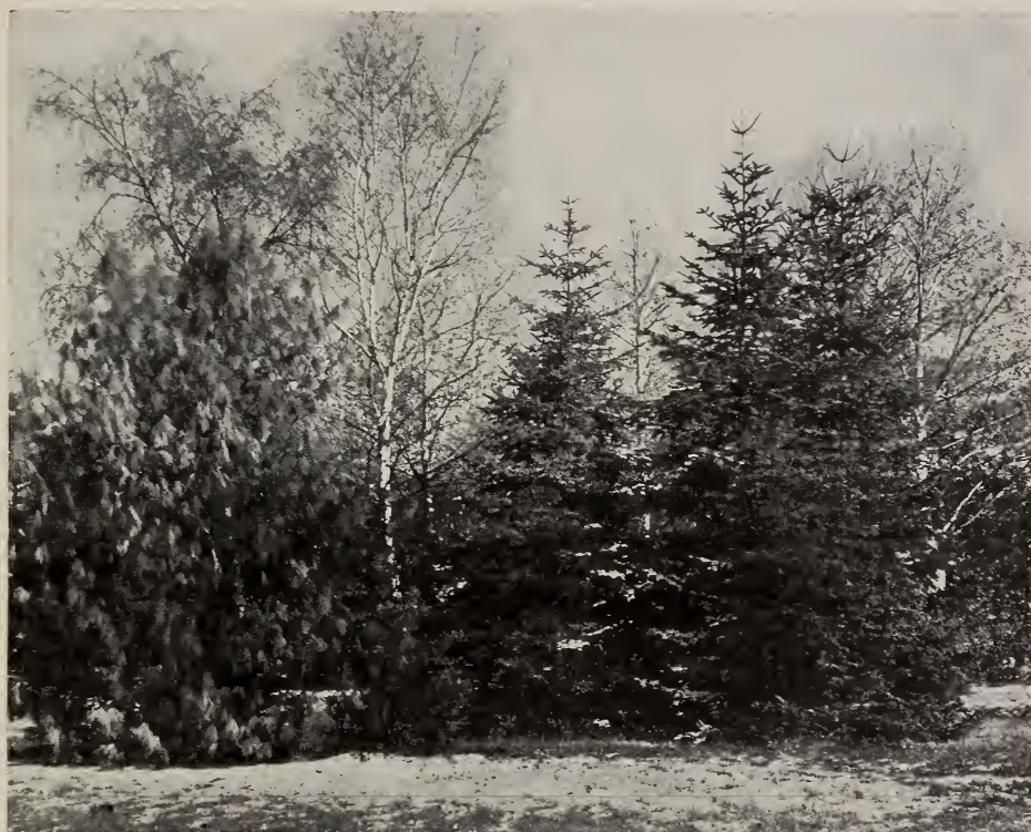
PINE, FIR AND WHITE BIRCH : A SUGGESTION FOR A CHRISTMAS GIFT