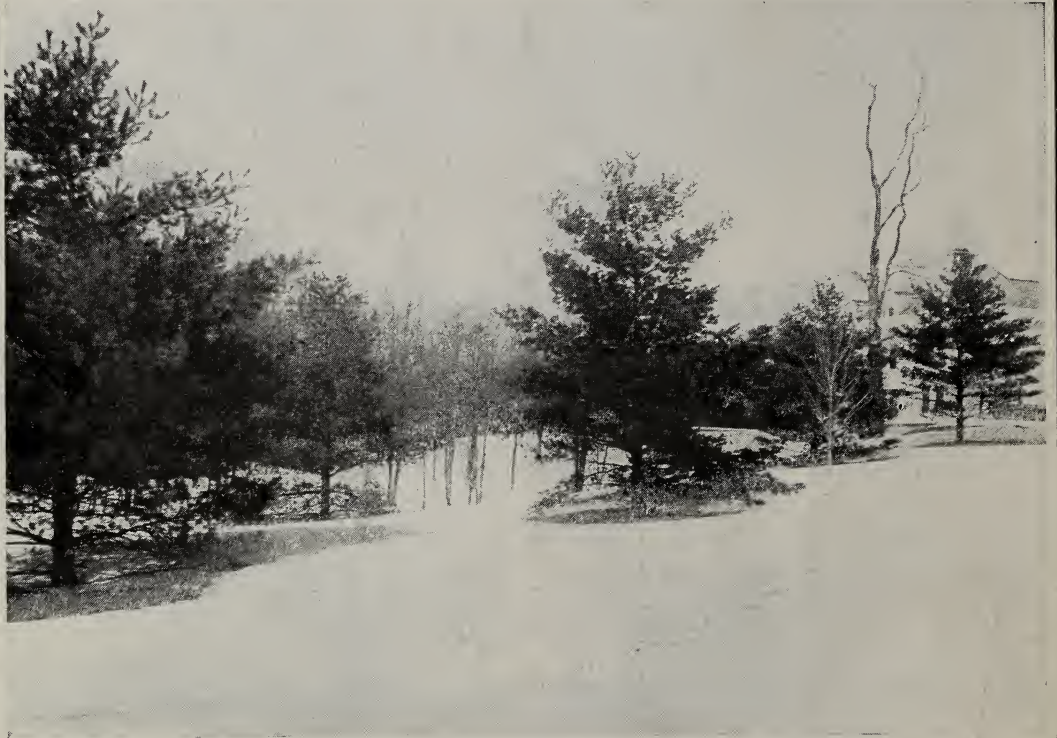
WHITE PINE PLANTED IN WINTER FROM HICKS NURSERIES PHOTOGRAPHED 1912

Plan winter work for your men collecting wild cedars and shrubs, or moving evergreens and deciduous trees on your place, with the co-operation of our apparatus and men. For humus and irrigation see page 4.