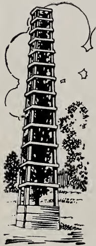
A single Cedar or other evergreen twenty feet high can be shipped as readily as a carload.