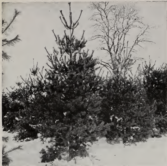
WHITE PINE 10 to 14 Ft. This block was transplanted in February 1912. Out of 150 trees only 1 died. They will plant just as successfully on your grounds now. They are grown economically in large quantities, and are, therefore, offered at lower price than formerly. They are growing in squares 12 ft. apart. Their production has required time, skill, and money. Their value to you consists in the 8 years' waiting you are saved; their broad, dense tops and vigorous growth the first year.