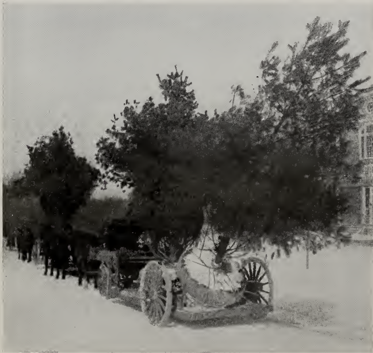
WHITE PINES 14 ft. We have 200 such trees. They are 8 to 10 ft. broad. They can be crated as illustrated on page 6, shipped a thousand miles and safely planted by your men. We have shipped 125 carloads of big evergreens, 8 to 30 ft. high; satisfaction guaranteed.

Don't put off till April what can be done in December. Talk it over with your landscape architect and gardener.