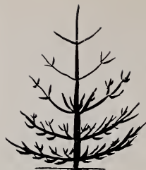
Open because of rapid growth