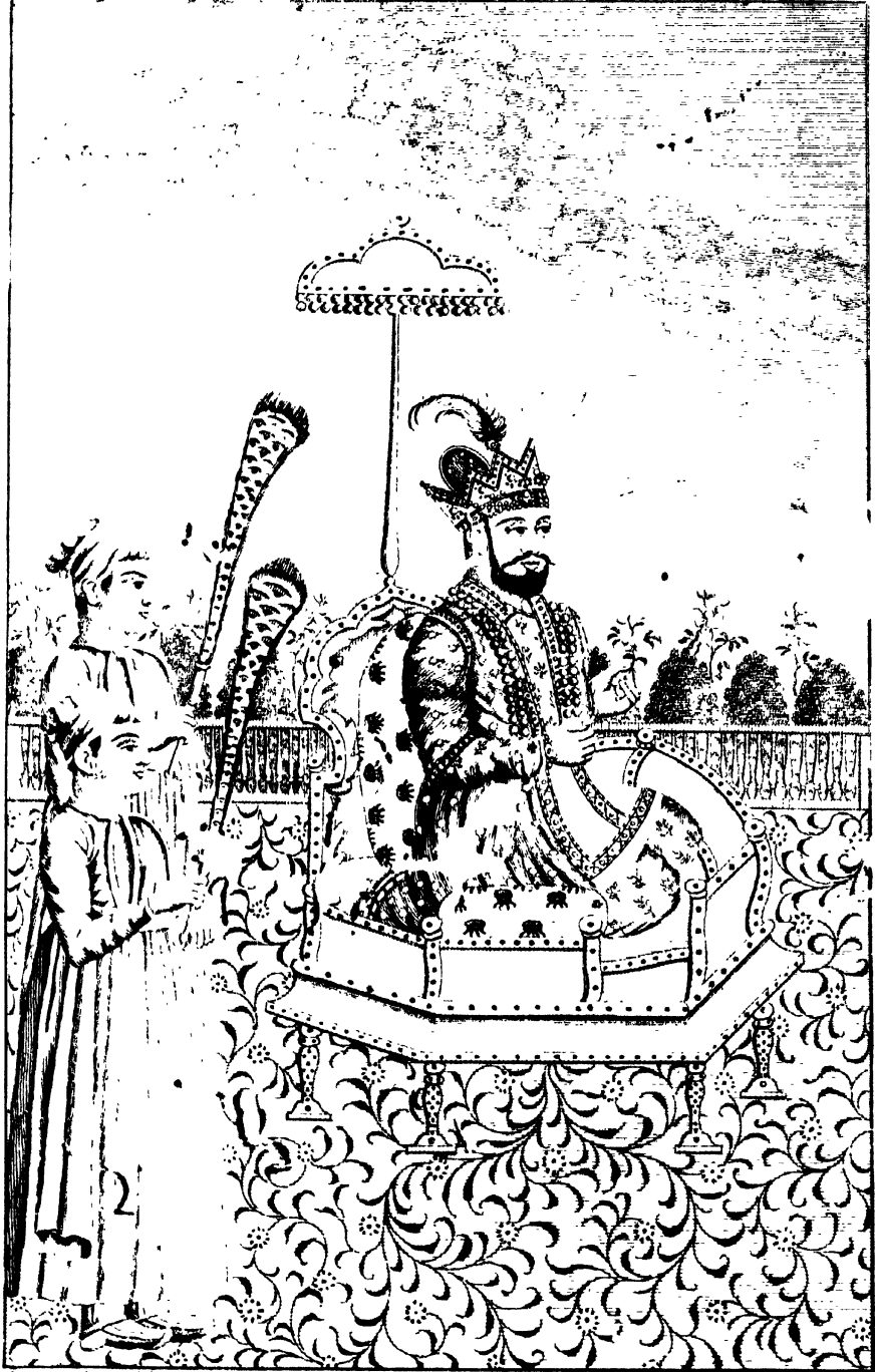
Mahomed Akbar Emperor of Hindostan: Died A.D. 1604.