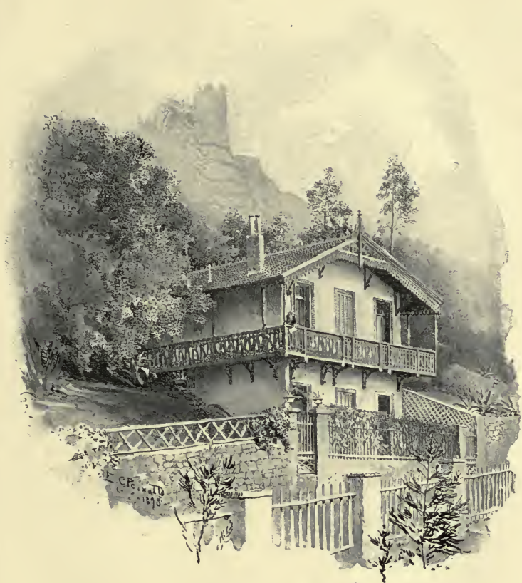
CHALET LA SOLITUDE, HYÈRES.