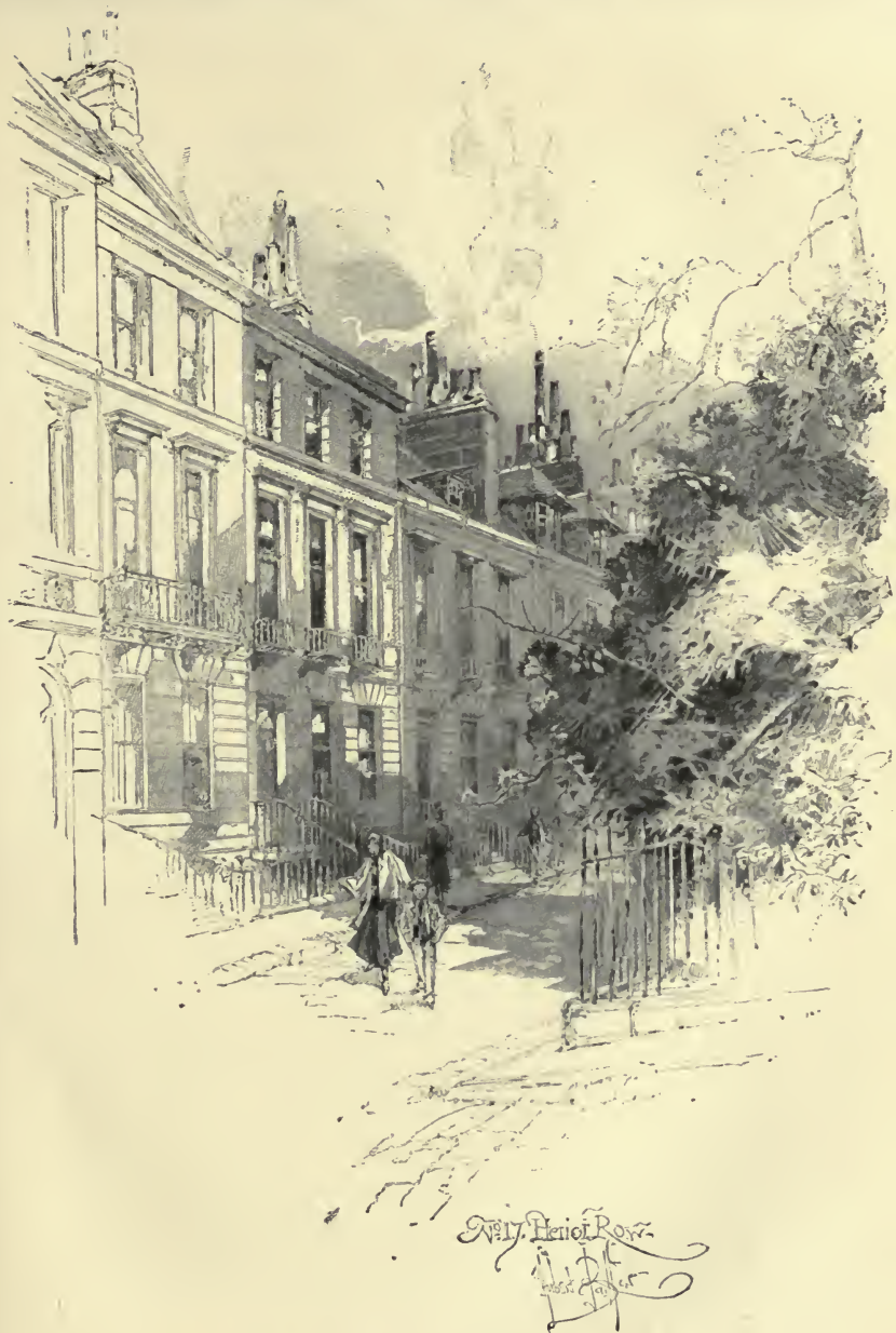
EDINBURGH HOME OF THE STEVENSON FAMILY, 1853-1887.