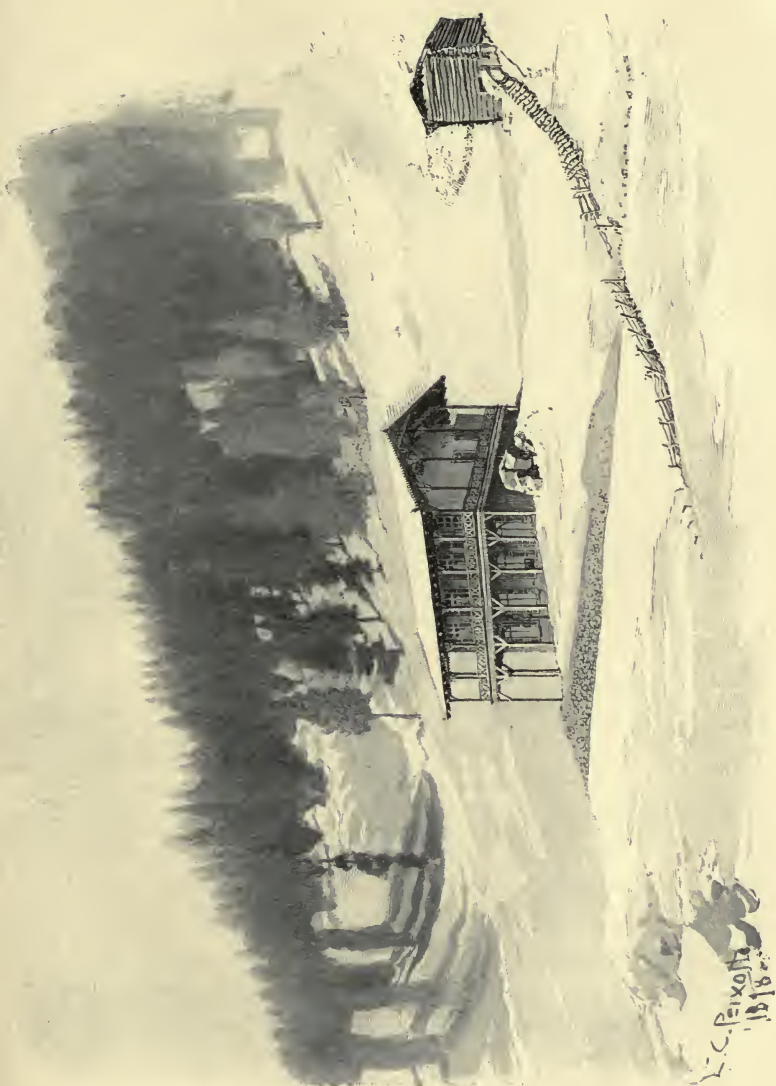
CHALET AM STEIN, DAVOS-PLATZ, IN 1881-82.