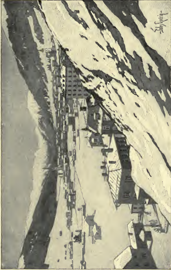
GENERAL VIEW OF DAVOS.