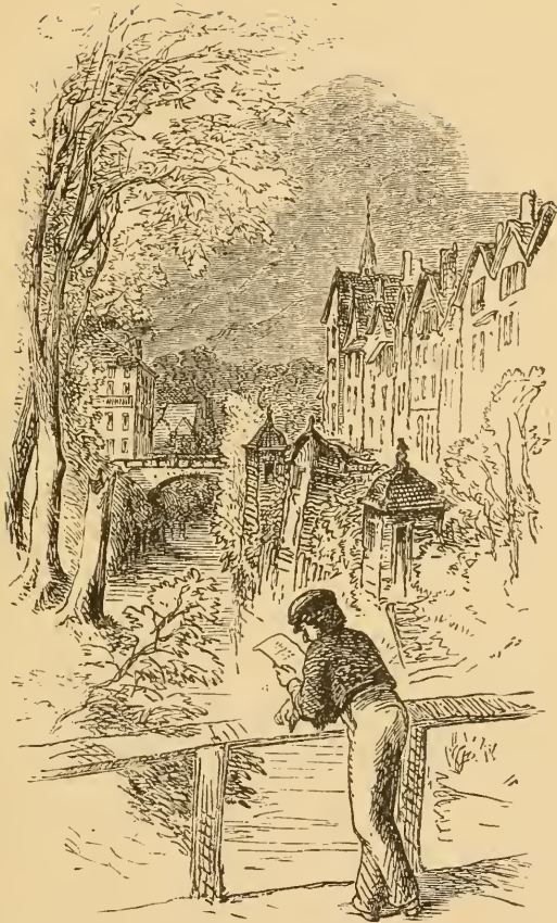
A LAZY IDLE BOY.