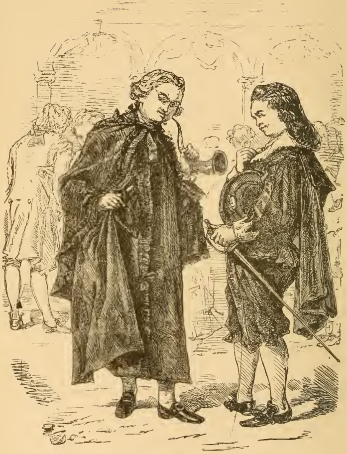
SIR J-SH-A R-N-LDS IN A DOMINO. — DR. G-LDSM-TH IN AN OLD ENGLISH DRESS.