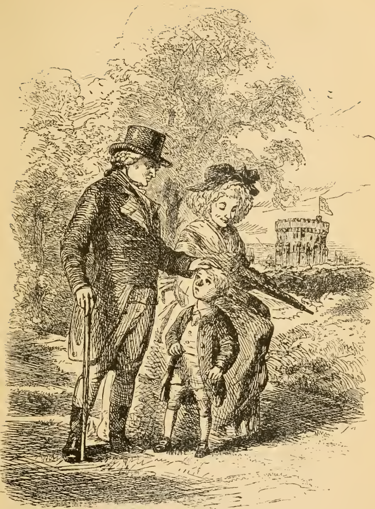
A LITTLE REBEL.