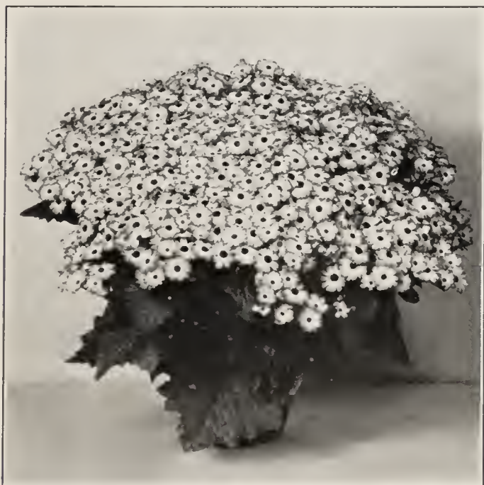
CREMER'S PRIZE STRAIN CINERARIAS (See page 2)