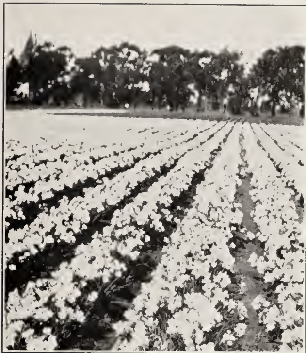
A GLIMPSE OF S. S. S. FREESIAS IN THEIR NATIVE GLORY