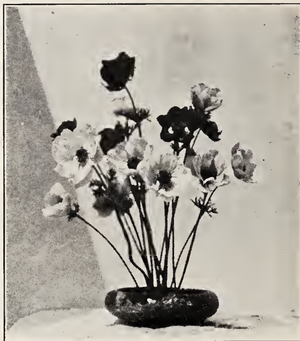
A BOWL OF ANEMONE DE CAEN HYBRIDS

In the Northwest fields, experience has taught us that this section produces the best bulbs.