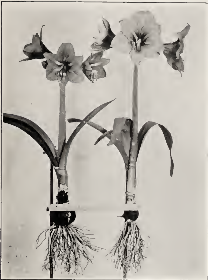
Left—GIANT AMERICAN HYBRID. Right—S. S. S. PRIZE FORCING STRAIN

NOTE—The smaller bulb of the S. S. S. produced the larger flower.