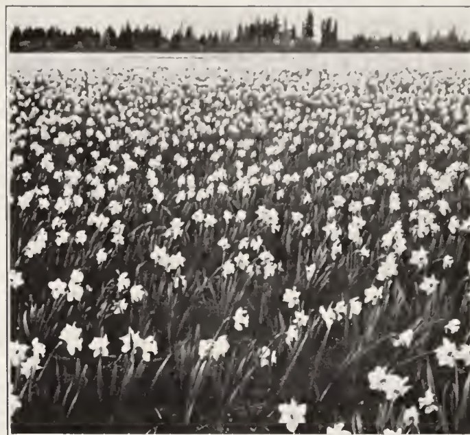
SOME GRAND DAFFODILS ON A GRAND SCALE IN THE NORTHWEST