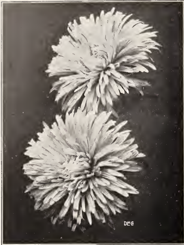
ASTER, AMERICAN BEAUTY