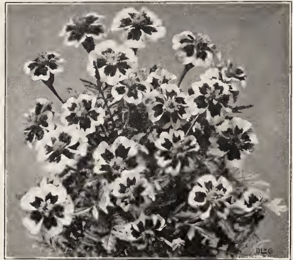
MARIGOLD, LEGION OF HONOR