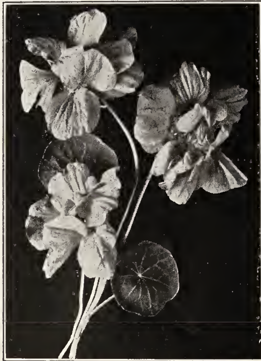
NASTURTIUM, GOLDEN GLEAM