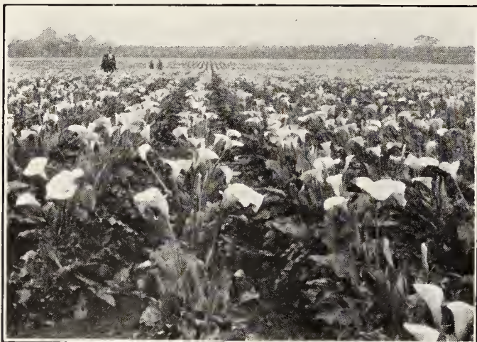
CALLAS BEING GROWN FOR S. S. S. & Co.

Elliottiana. Yellow. 2-2½ in., 2½-3 in., 3-3½ in., 3½ in. and up.