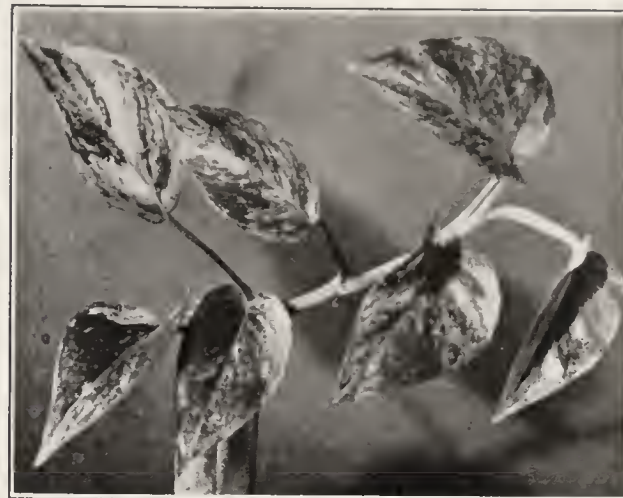
PHILODENDRON CORDATUM AND POTHOS AUREA (VARIEGATED PHILODENDRON)

pictured above are becoming increasingly popular and may some day replace Ivy in the home. Much more hardy and well withstands the abuse most other house plants will not take.