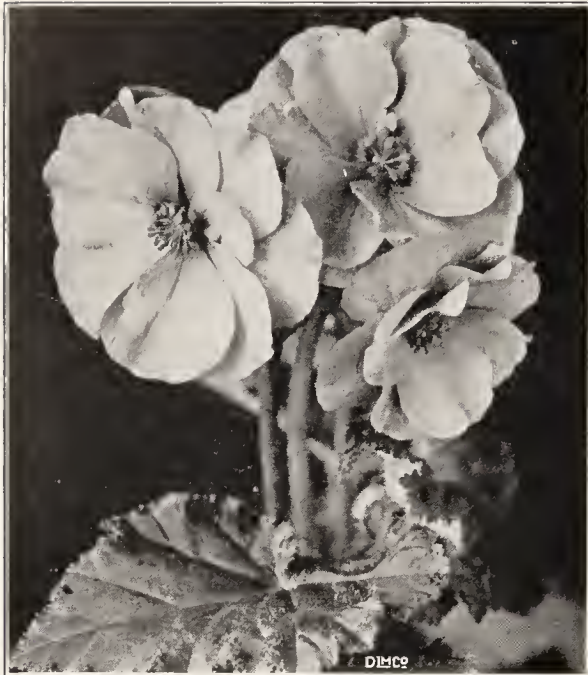
BEGONIAS, TUBEROUS ROOTED (See page 9)