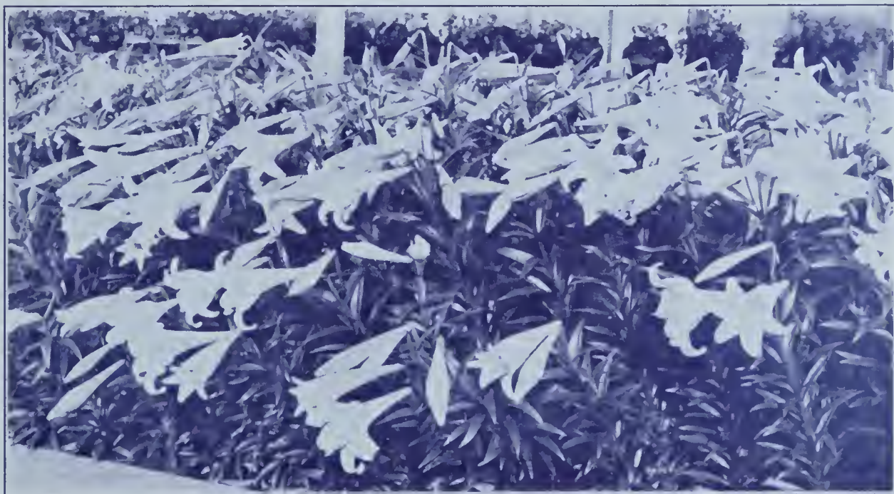
LILIUM HARRISI FOR THANKSGIVING