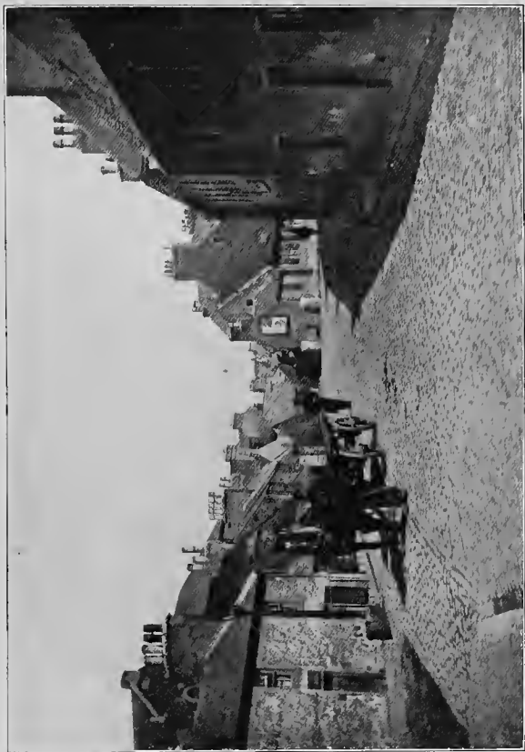
STREET IN IRVINE, SHOWING BRIDGEGATE HOUSE, WHERE POE STAYED, AT EXTREME RIGHT