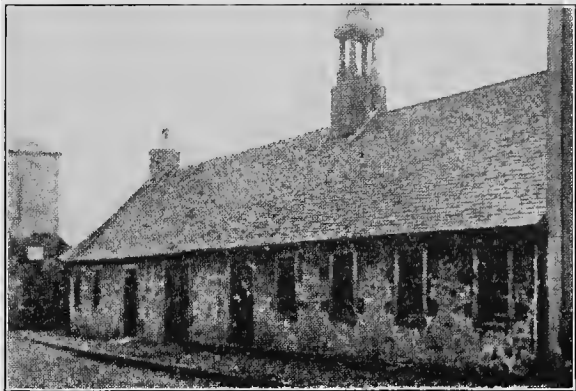
WHERE POE WENT TO SCHOOL, AT IRVINE, SCOTLAND