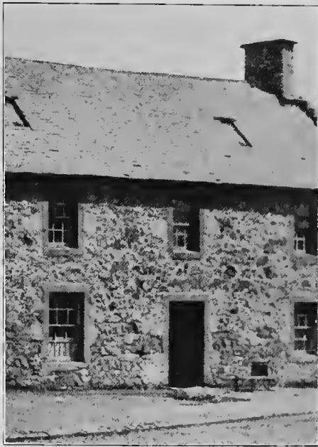
THE FOWLDS HOUSE, KILMARNOCK, SCOTLAND, WHERE POE STAYED