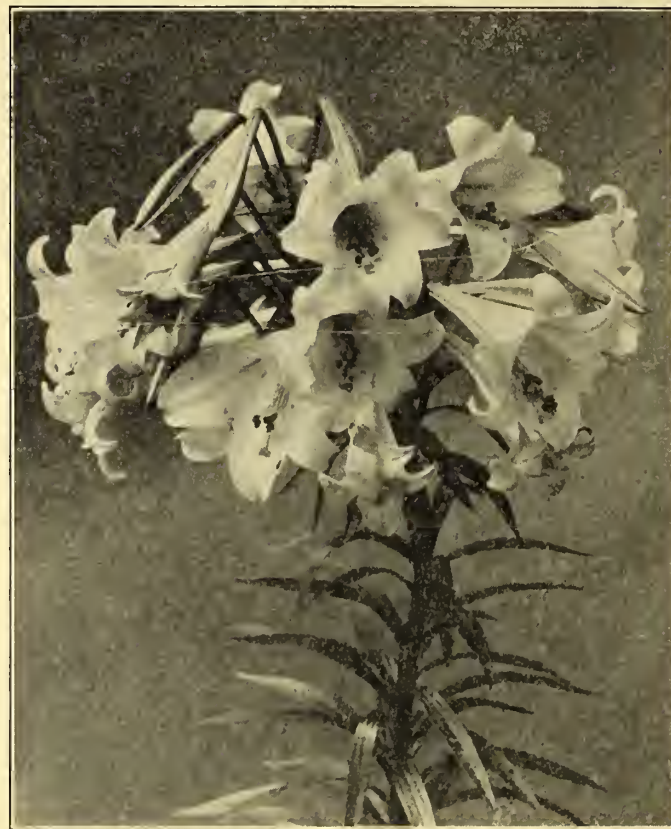
LILIUM ERABU—A. B. C. TRUE STRAIN

Sizes 6-8 in., 7-9 in., 8-10 in., 9-10 in., 10-12 in., 11-13 in. Write for Prices.