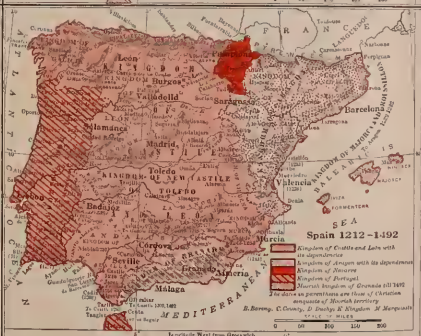
DEVELOPMENT TOWARD NATIONAL UNITY, 910-1492