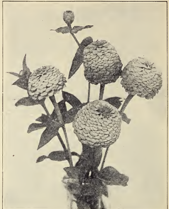
Lilliputian Zinnias, Are Very Popular

Salmon Rose, Scarlet Gem, White Gem, Golden Gem and Mixed .....Each, Per Pkt. 10c