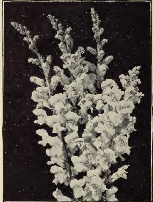
Antirrhinum or Snapdragon