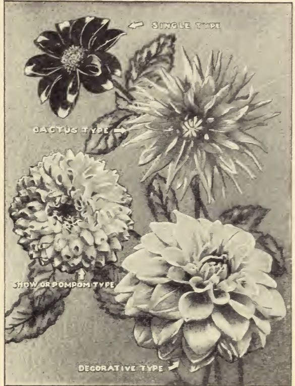
Different Types of Dahlias

Early flowering, producing several flower spikes from each bulb during July and August. Each, 5c; Doz., 50c