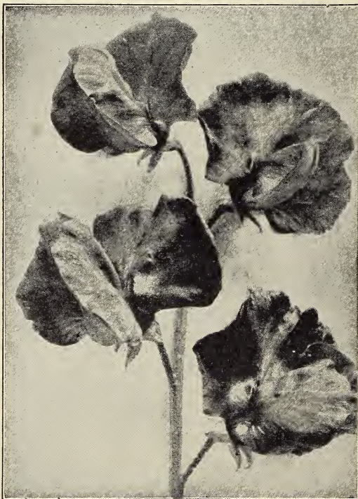
"Butterfly" or "Orchid Flowered"

Choice Mixture of Grandiflora Type are considered easier to grow than the Spencers.....Oz. 10c; ¼ lb. 30c; 1 lb. $1.00