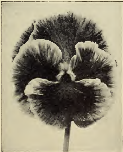
Type of Barnard's "Florists' Mixture"