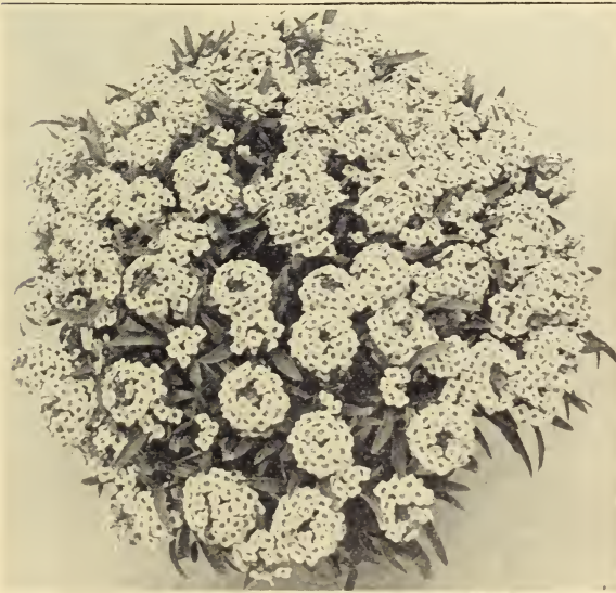
Barnard's Little Gem Alyssum