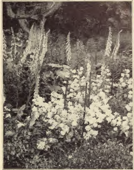
Canterbury Bells and Foxglove

They are quite hardy if planted in a well-drained position, and, with a slight covering of litter during the winter. Each, 25c; Doz., $2.50 Autumn Glow, pinkish-bronze. Old Homestead, pink. Victory, white. Indian, red. Golden Queen, yellow.