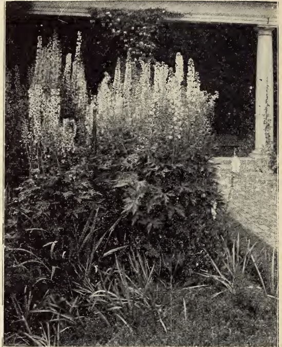
Delphinium Hybridum "Blue Bird" Strain

This pretty and interesting annual blooms most profusely from July till November; their exquisite pale lavender blossoms are excellent for cutting; plants grow about 18 inches high. Sow where plants are to bloom..... Pkt. 10c