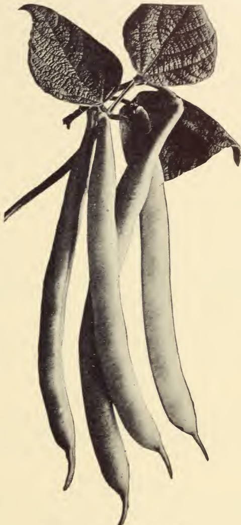
Barnard's Stringless Green Pod