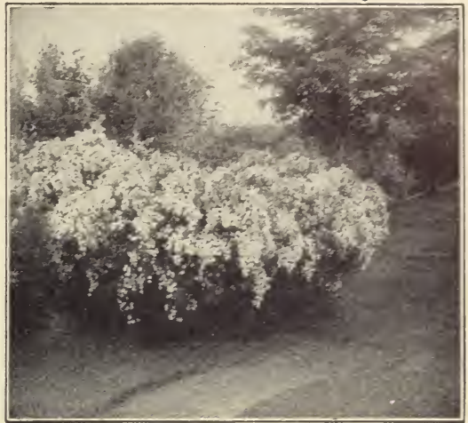
Spirea Van Houttei (Bridal Wreath)

Typhina laciniata (Staghorn Sumac). The branches are densely covered with velvety hairy-like growth resembling the developing Elks Horn. Deeply serrated leaves whose deep crimson color and persistent crimson fruit makes it attractive..... 3 to 4 Feet, Each, 75c