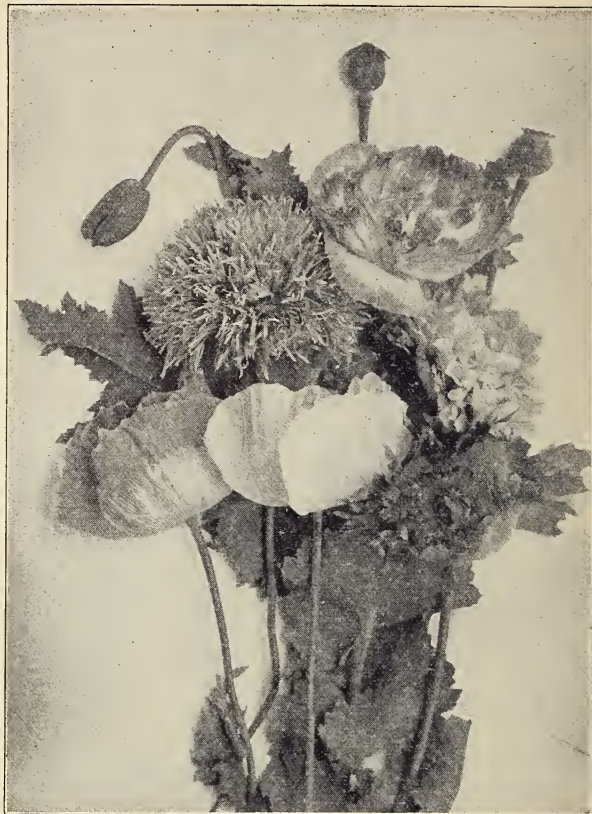
Barnard's Special Double and Single Poppies

Hybridum. Extra Double "Market Strain".....25c