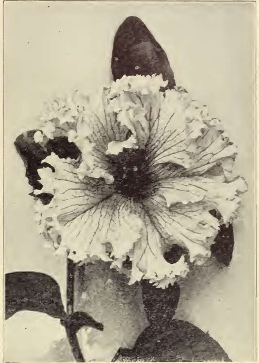
Type of Barnard's "Mammoth" Single