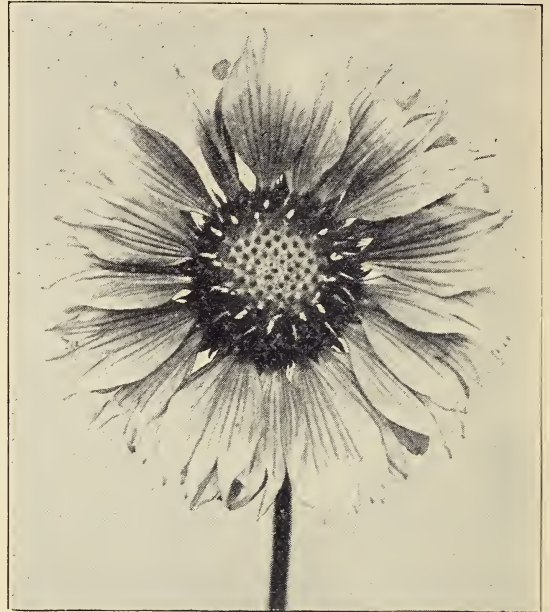
Gaillardia, The Dazzler