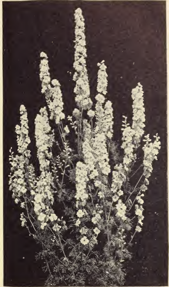
Larkspur, La France and Los Angeles Type