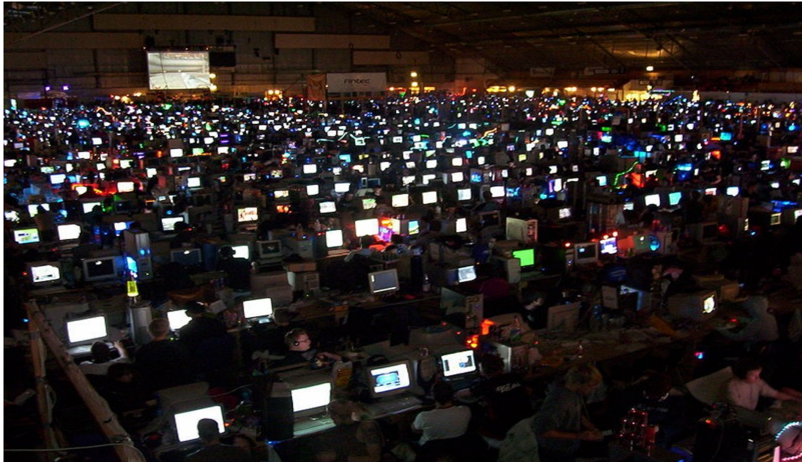
File:Winter 2004 DreamHack LAN Party.jpg

Have your own parties to edit Wikipedia. Wikipedia is always more fun to edit with wine and chocolates :)