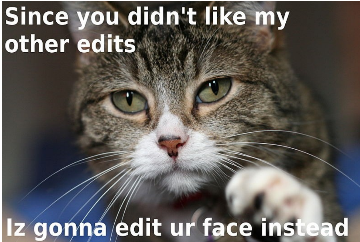
File:I hate your edits.JPG

If your subject is interesting enough, your boring Wikipedia article will speak for itself. Don't get flowery – this is an encyclopedia, after all.