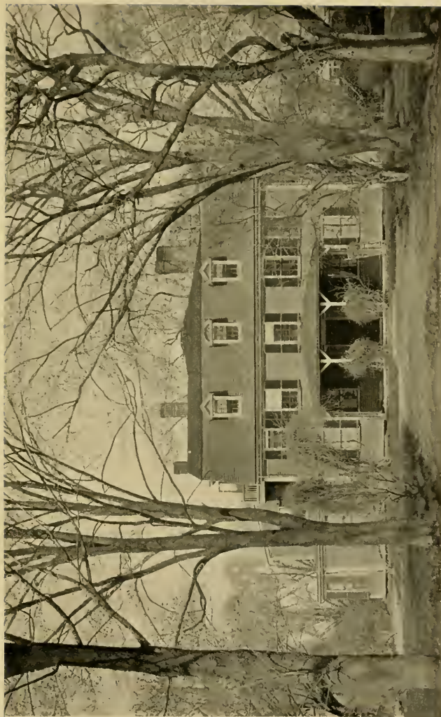
THE OLD QUINCY HOUSE, QUINCY