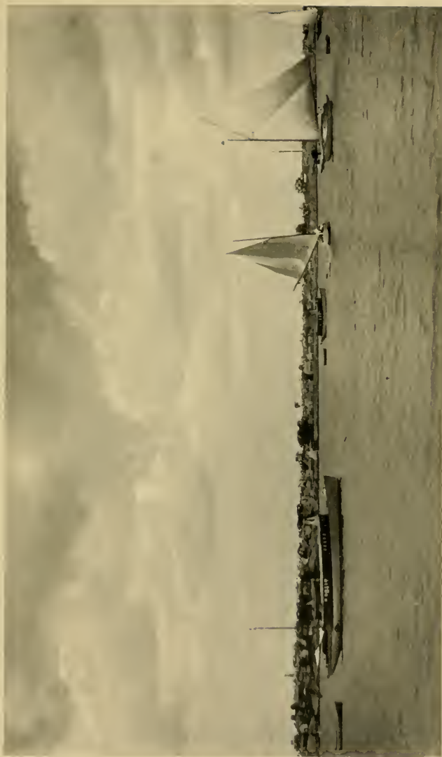
VIEW OF MARBLEHEAD HARBOR The Land at the Extreme Right is Fort Sewall