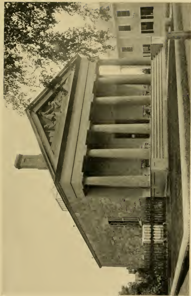
PILGRIM HALL, PLYMOUTH