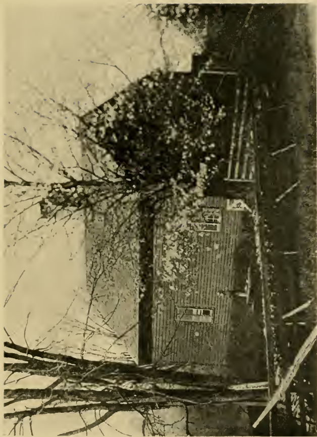
THE HAWTHORNE COTTAGE, LENOX Destroyed by Fire June 22, 1890