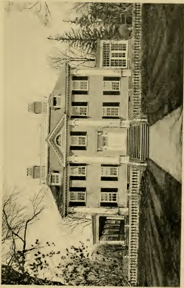
WASHINGTON'S HEADQUARTERS, CAMBRIDGE Well Known in Recent Times as the Home of Longfellow