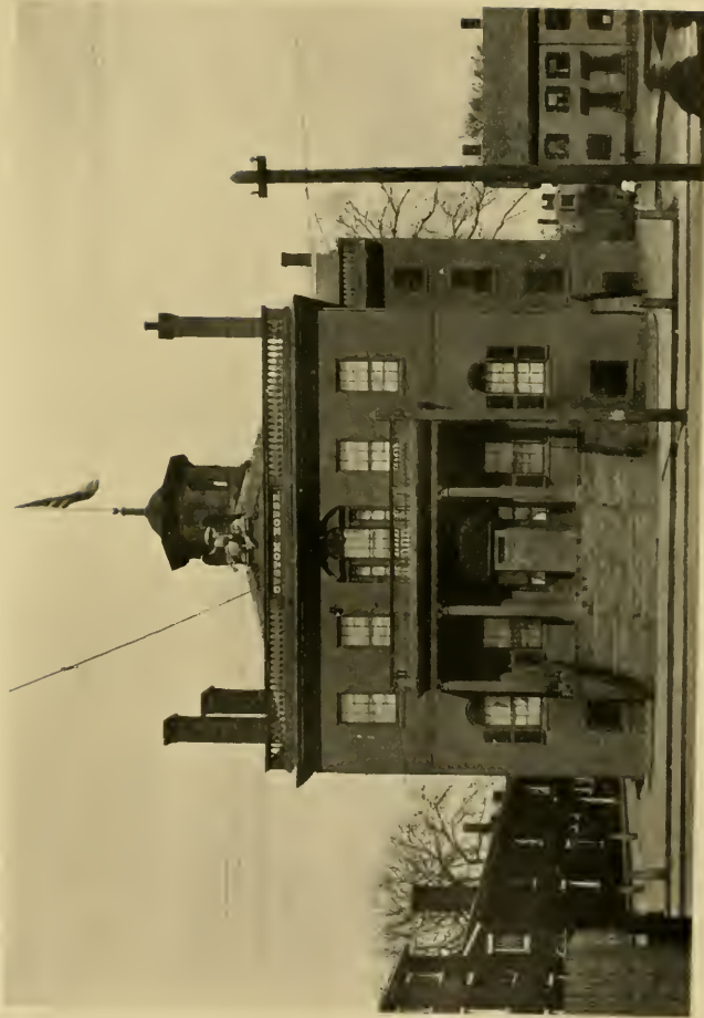
THE CUSTOM HOUSE AT SALEM