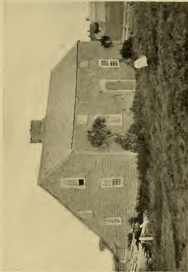
A TYPICAL NANTUCKET HOUSE Built About 1675