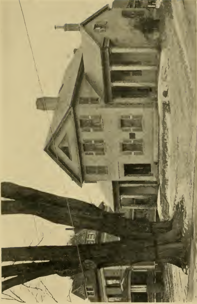
THE EDWARDS ELM, NORTHAMPTON Planted by Jonathan Edwards whose home stood on the site of the Brick House