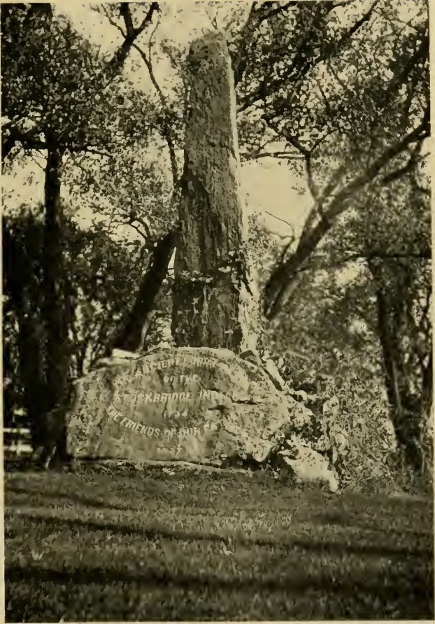
THE INDIAN BURIAL PLACE, STOCKBRIDGE