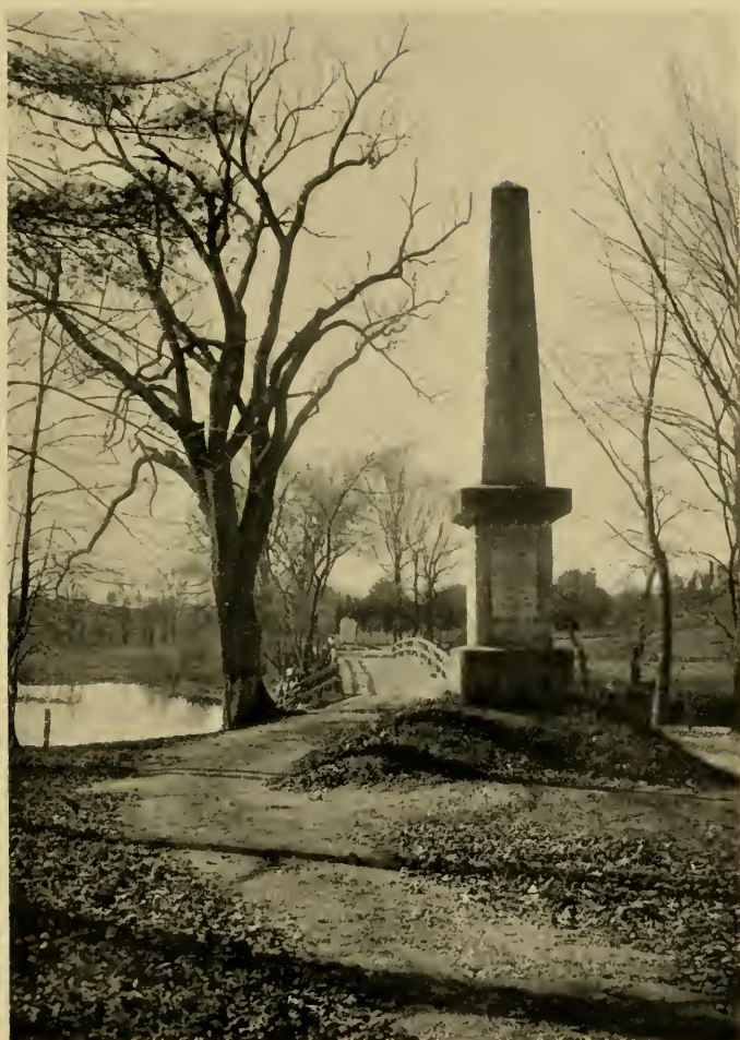
THE BRIDGE AT CONCORD Showing the Monuments at Each End of the Bridge