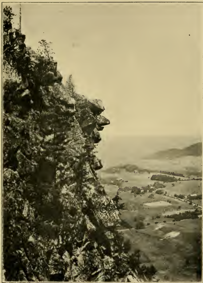
THE STONE FACE ON MONUMENT MOUNTAIN, STOCKBRIDGE