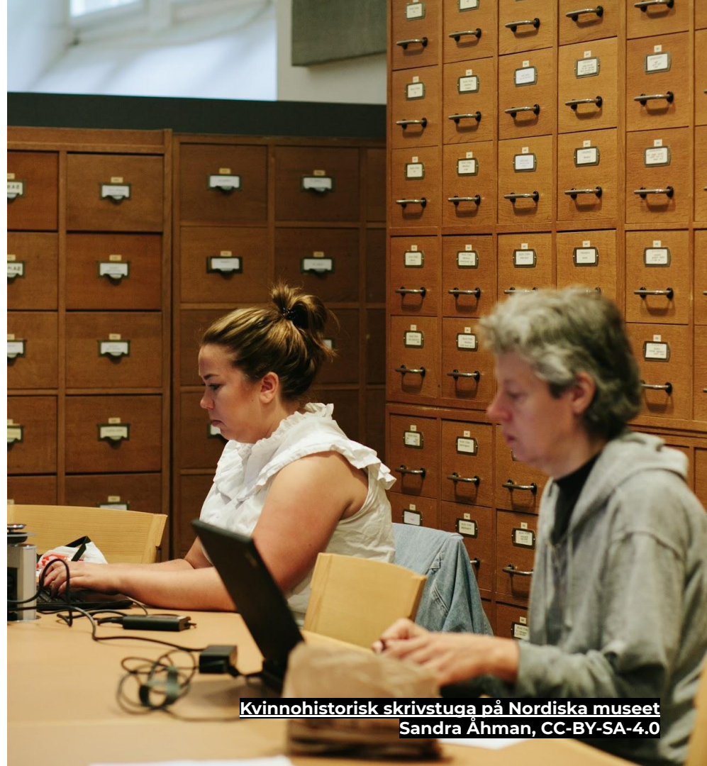
Kvinnohistorisk skrivstuga på Nordiska museet