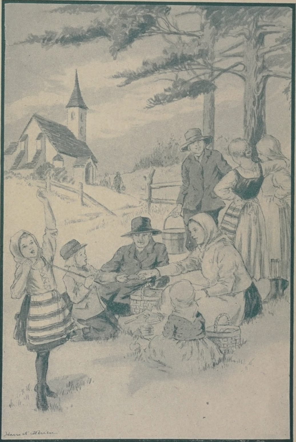
“ THINGS TASTED SO GOOD OUT OF DOORS ”