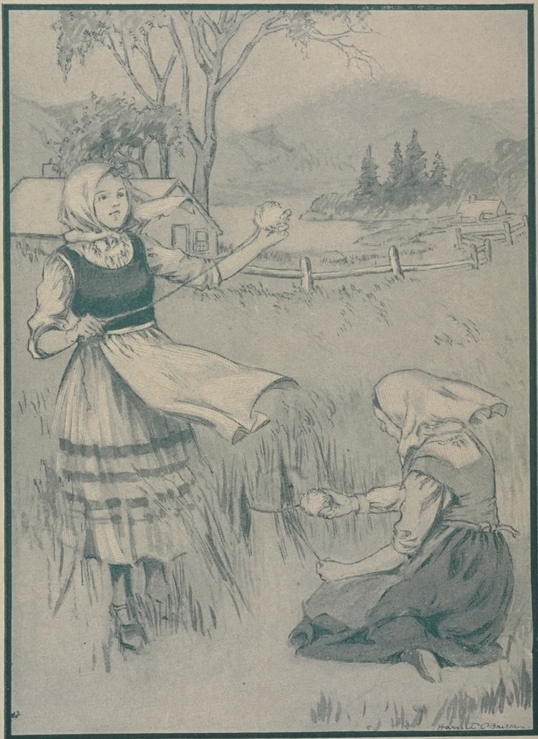
"WOUND COLORED YARN AROUND THE RYE STALKS"