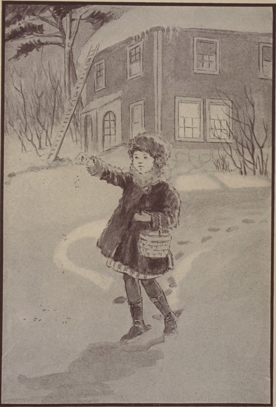
“ SHE CARRIED OUT A BASKET FILLED WITH CRUMBS AND GRAIN ”