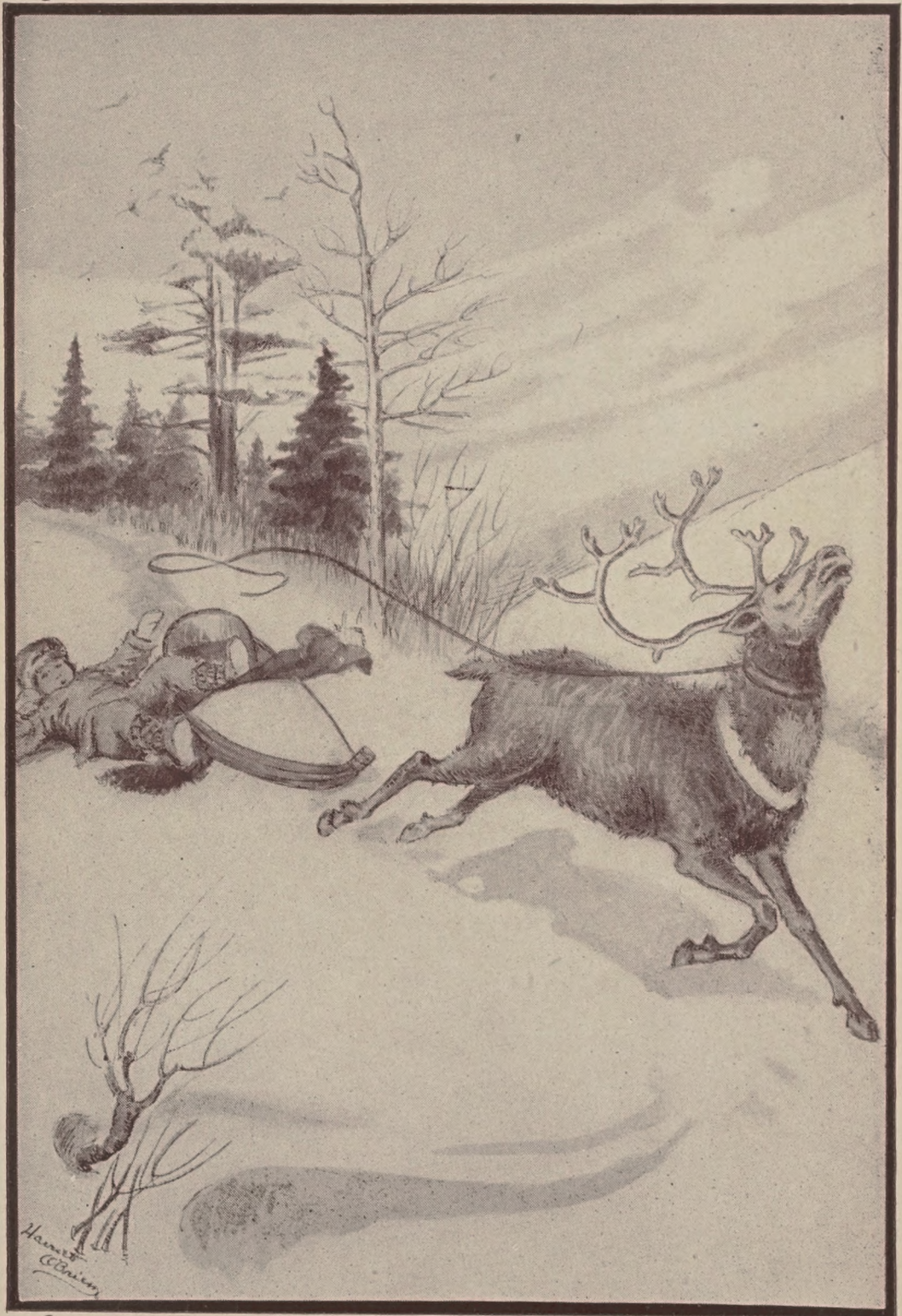
“THE REINDEER SUDDENLY SWERVED IN SUCH A WAY THAT JUHANI WAS PITCHED OUT.” (See page 40)