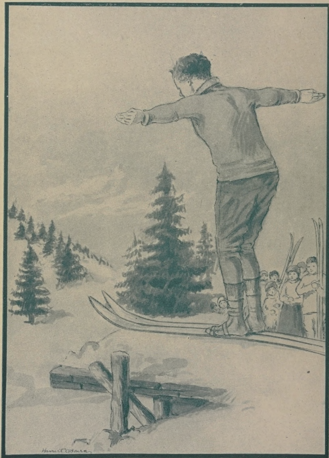
“WAVING HIS ARMS TO KEEP HIS BALANCE, JUMPED FAR FORWARD”