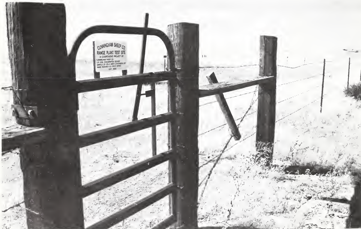
Ranchers in Umatilla County, Oreg., can take a close look at range plants adapted to the area's low annual rainfall at this conservation plant demonstration site.

Hugh Barrett, State range conservationist, SCS, Portland, Oreg.