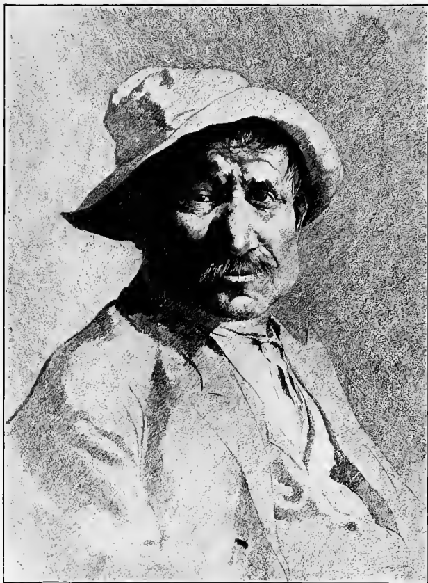
THE SINEW AND BONE OF ALL THE NATIONS