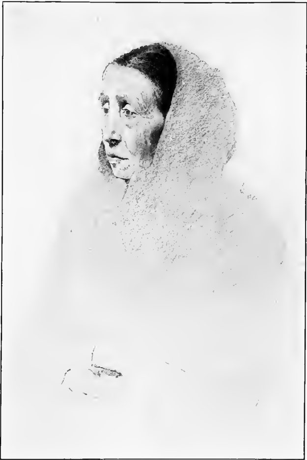
THE UNGROOMED MOTHER OF THE EAST SIDE