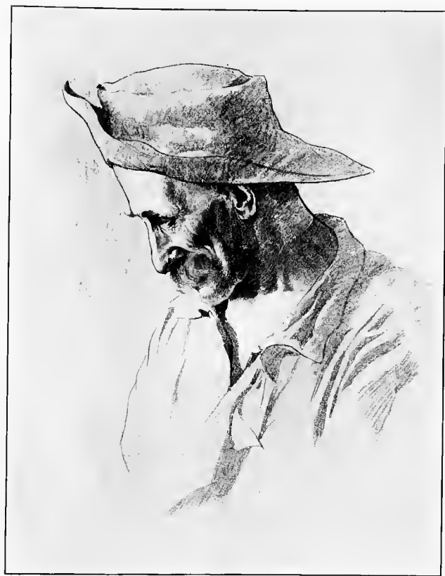
A FRESH INFUSION OF PIONEER BLOOD