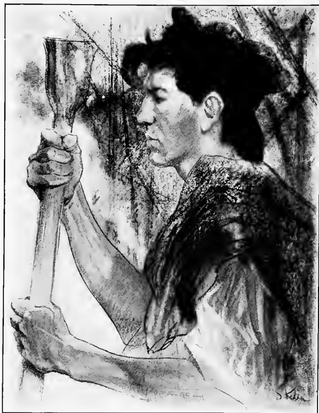
ROUGH WORK AND LOW WAGES FOR THE IMMIGRANT