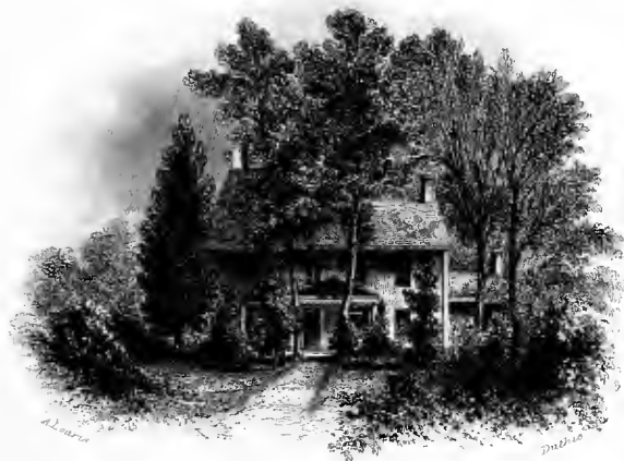
The Homestead, Chester Co Penn.