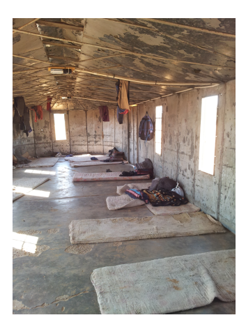
Figure : Donkerbos Primary School, boys' hostel