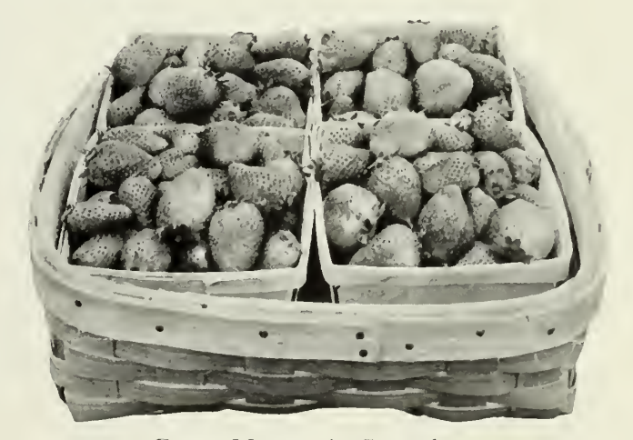
Green Mountain Strawberry Note size of berries. (Photo taken in middle October.)

5. Remarkable yield. In the fall, 1934, our two-year-old field was estimated to have set fruit at the rate of 5,000 quarts per acre, but, unfortunately, about half the berries were caught by a severe frost in October. The summer crop of the Green Monutain with us is about double that of the Howard 17, and this year it has continued ripening berries ten days after the last fruit of the Howard was picked. Set our pot grown plants now. You may let them produce two to four clusters of fruit per plant next June, and they will still bear a good crop next fall for you.