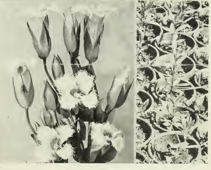
Gentiana Crinita (Fringed Gentian) with a suggestion of the thousands of plants available this fall.

This folder covers Wildflowers and Ferns only. We also have a very complete line of Perennial Plants, Evergreens, Deciduous Trees and Shrubs. These are listed in one General Catalog which is mailed February first, each year. If you did not receive your copy of this eatolog, last spring, please tell us,