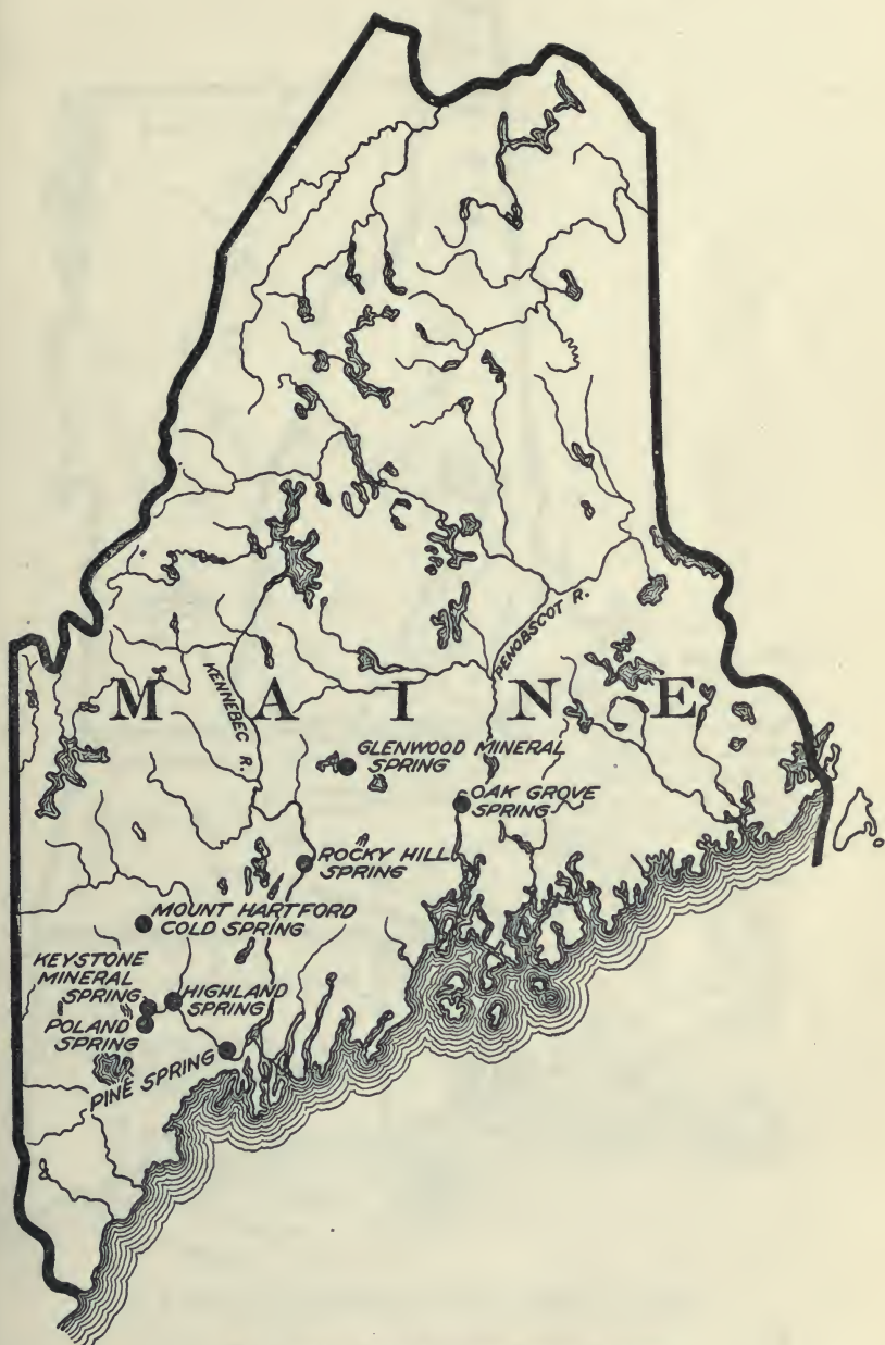
FIG. 1.—Map of Maine, showing location of springs.