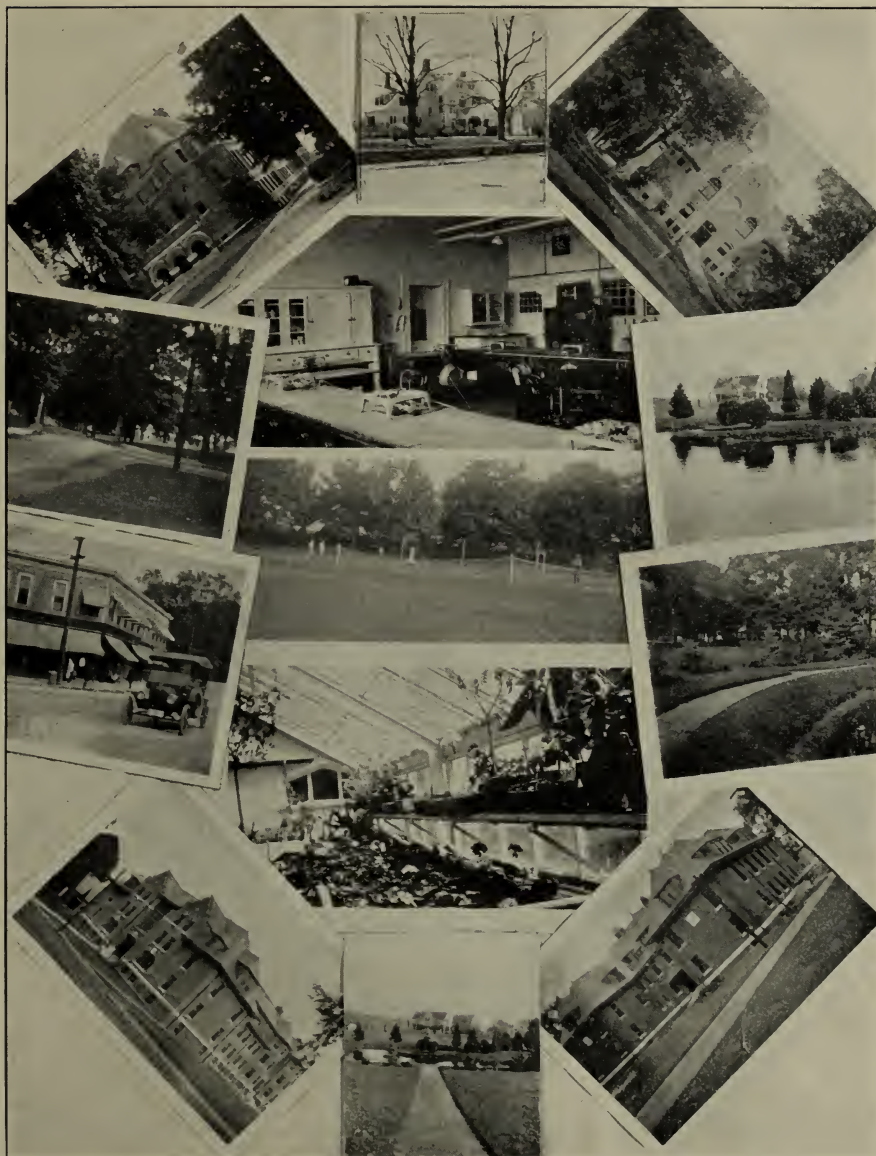
FAMILIAR SCENES AROUND NORMAL SCHOOL.