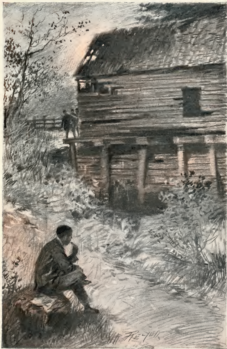
“The boy on the stone never moved.”