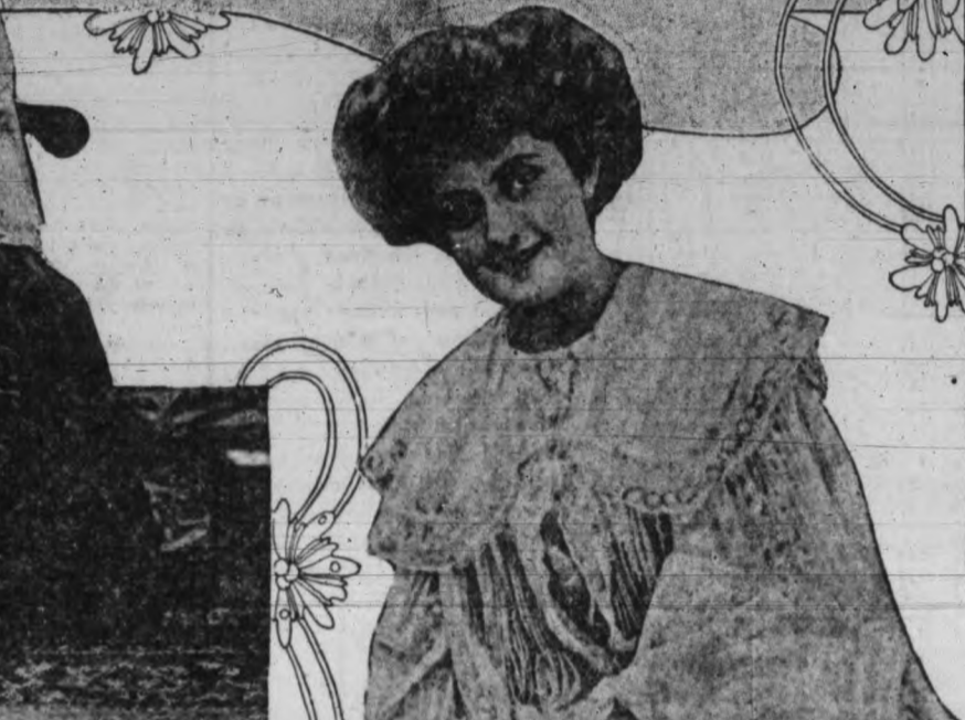
Take Off the Shoes You