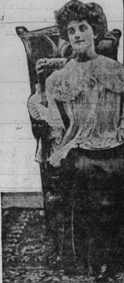
Hot Soup is a Recuperative