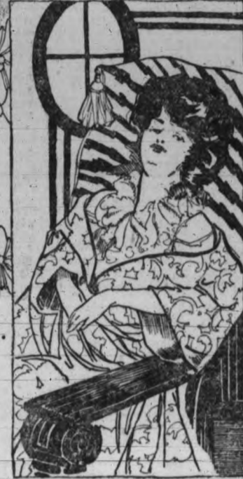
Fresh Neckwear Will Rest One