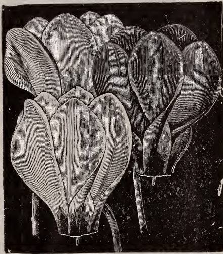
Cyclamen, Persicum Giganteum.

Single Bulbs free by mail. If desired by mail, add at the rate of 5 cts. per doz. for postage.