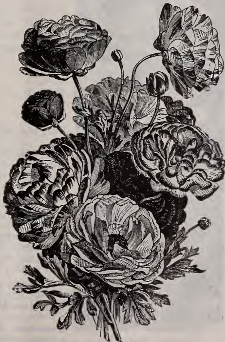
25 Bulbs at 100 rate. Ranunculus.

Very best mixed, all shades, per dozen, 10 cts.; per 100, 40 cts.; per 1000, $2.50.