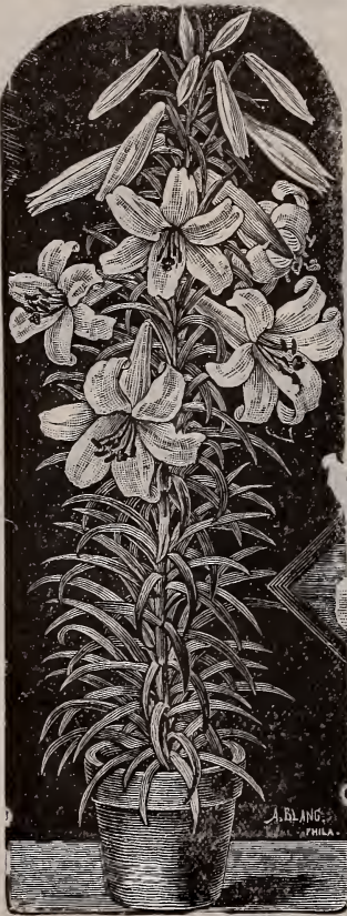
Bermuda Easter Lily.

We allow 10 per cent. discount on goods quoted