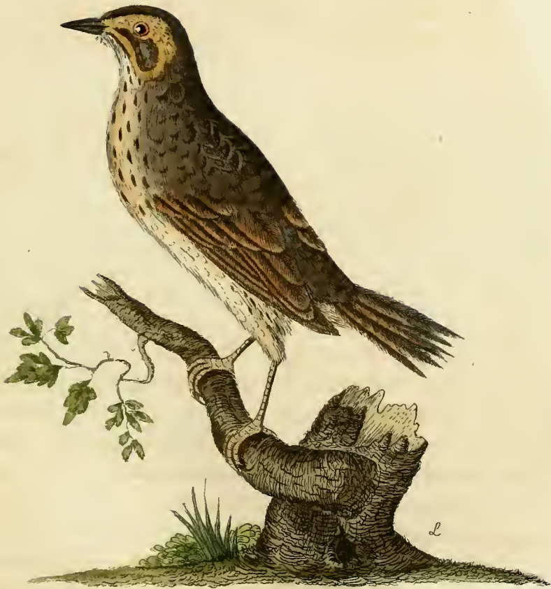
Sharp tailed Oriole.