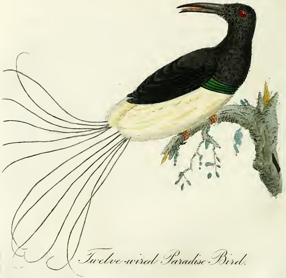
Twelve-wired Paradise Bird.