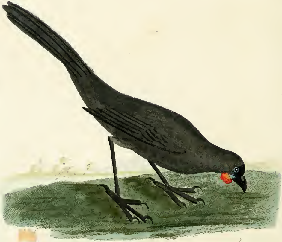
Cincereous Wattle Bird.