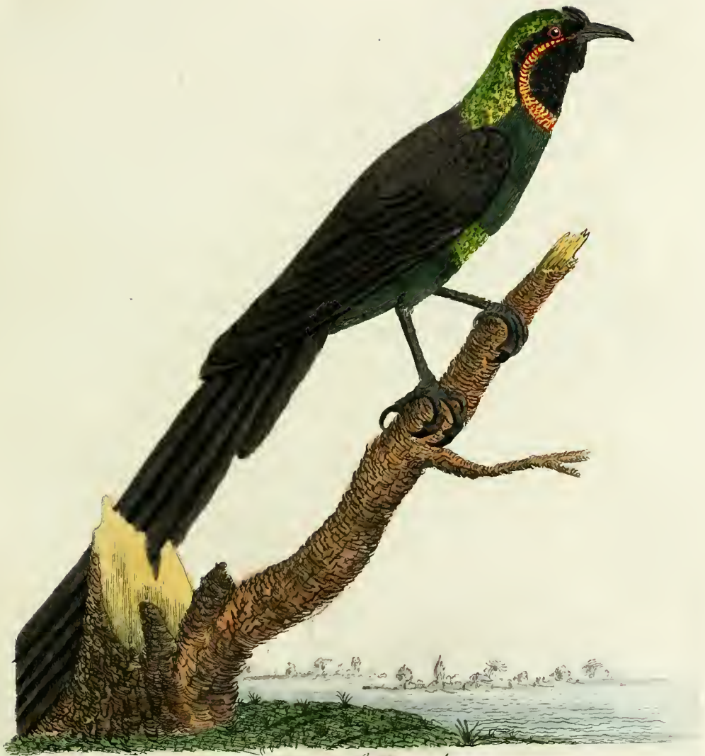
Gorget Bird of Paradise.