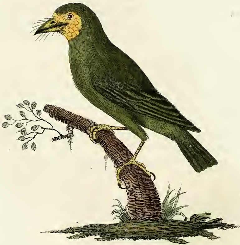
Buff faced Barbet.