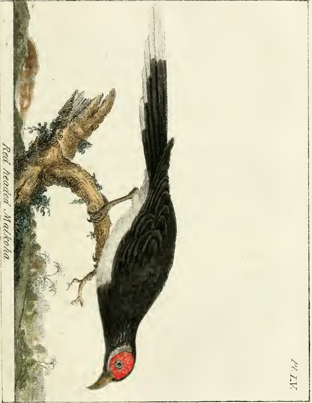
Red headed Malkoha.