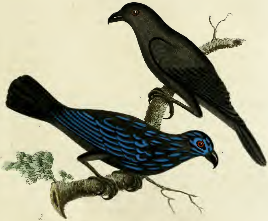
Blue Striped Roller.