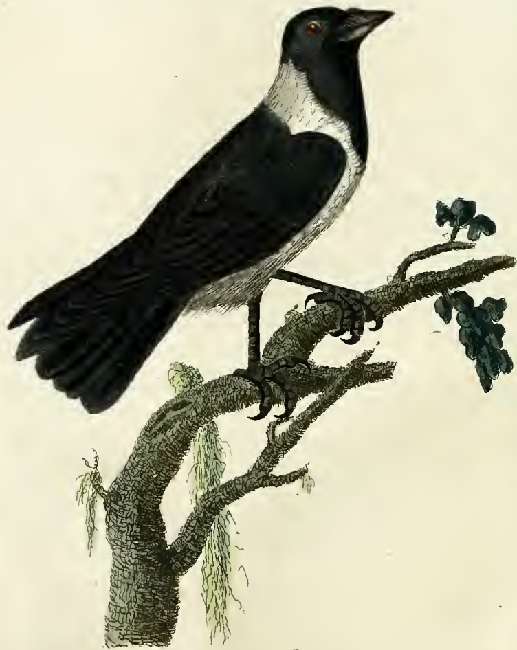
White Breasted Crow.