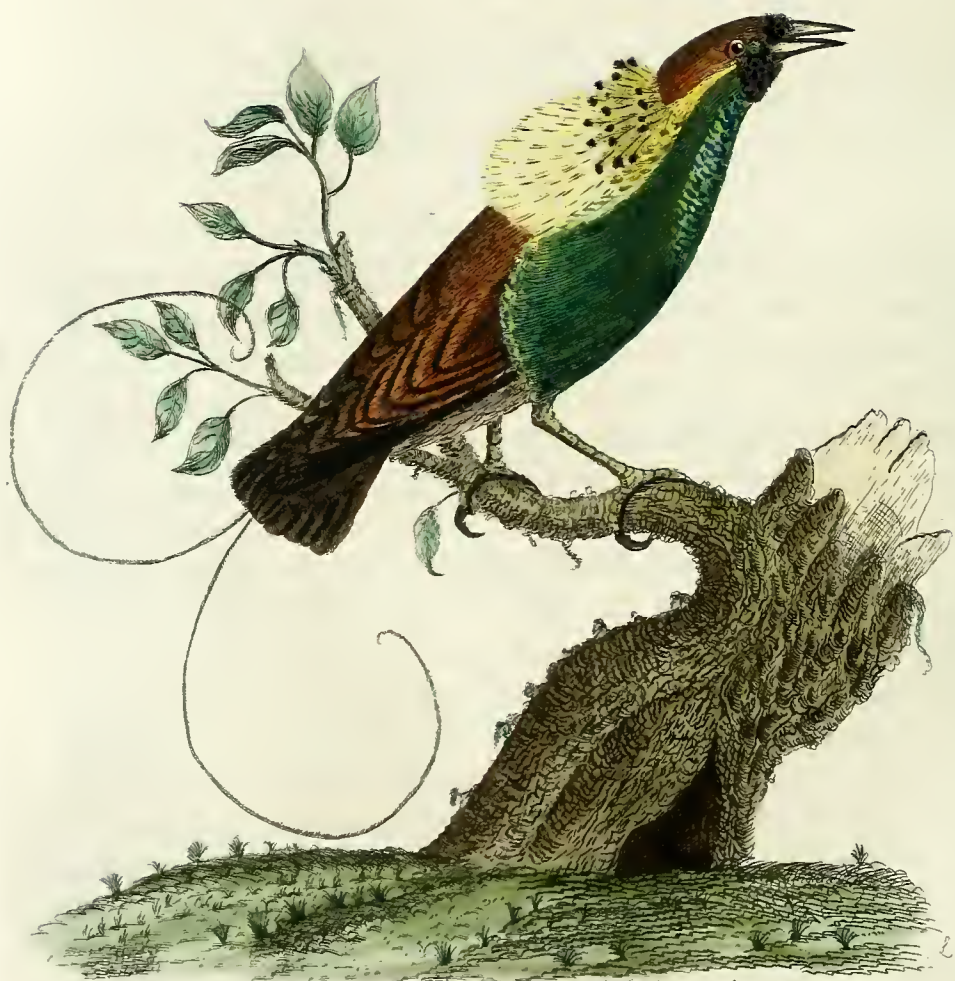
Magnificent Bird of Paradise.