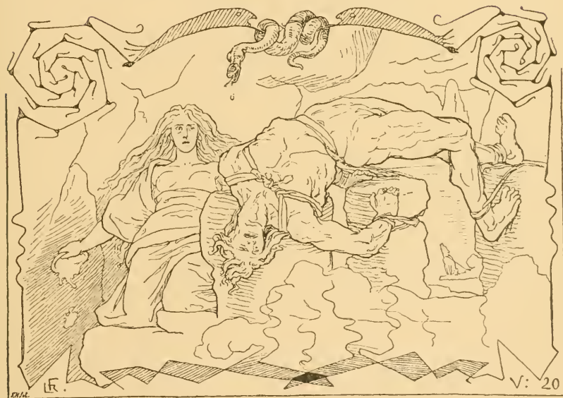
SIGYN, LOKE AND THE SERPENT.

reproaches the Asas with their own wrong doing,