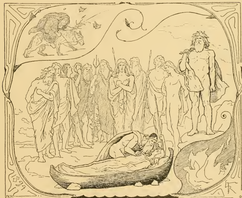
ODIN WHISPERING RUNES TO BALDER DEAD.

And when it had passed their horizon And Day went, and Night came, blackshrouded,