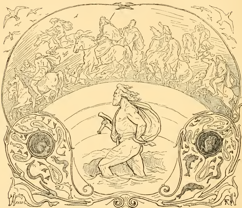
THE ASAS ASCENDING TO ASGARD OVER BIFROST.

But Loke relents not, and speaks not, Save when, her cup overflowing