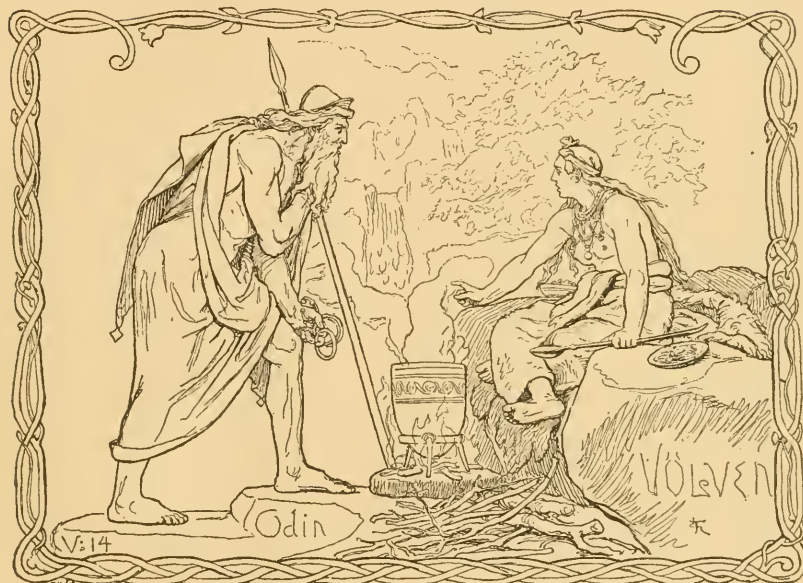
ODIN QUESTIONING VALA.

But Odin: "Speak, Vala! I shall bind thee with runes, that thou answer, For yet I must learn of his slayer."