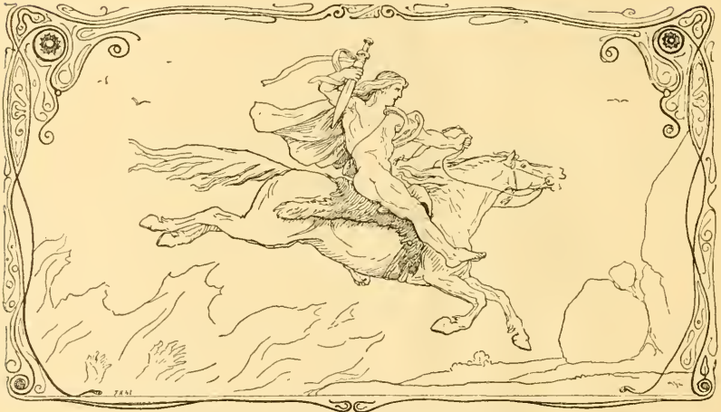
HERMOD DEPARTING FOR HELL.

In the meantime fleet Sleipner sped northward, And never he stopped or turned back As he galloped through valleys, o'er chasms, Save once, at the Bridge, where a herald, Its keeper, called "Hail!" to challenge His passing. "I am Hermod! To Hel