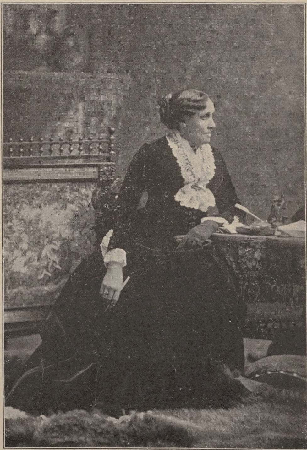
LOUISA. M. ALCOTT.