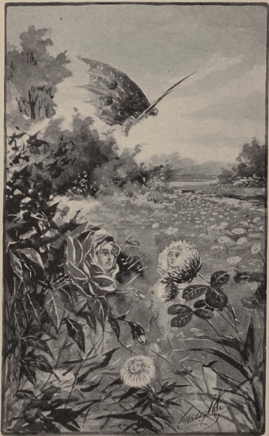
"A glittering butterfly soared to the sky."—Page 109. Flower Fables.