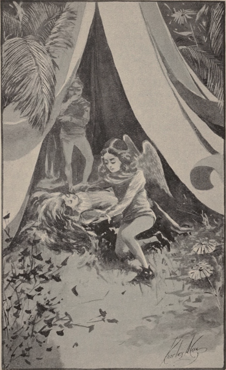
“ Thistle folded his arms about her.”—Page 72. Flower Fables.