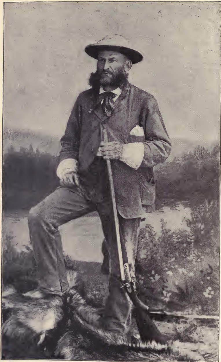
GENERAL GEORGE CROOK.