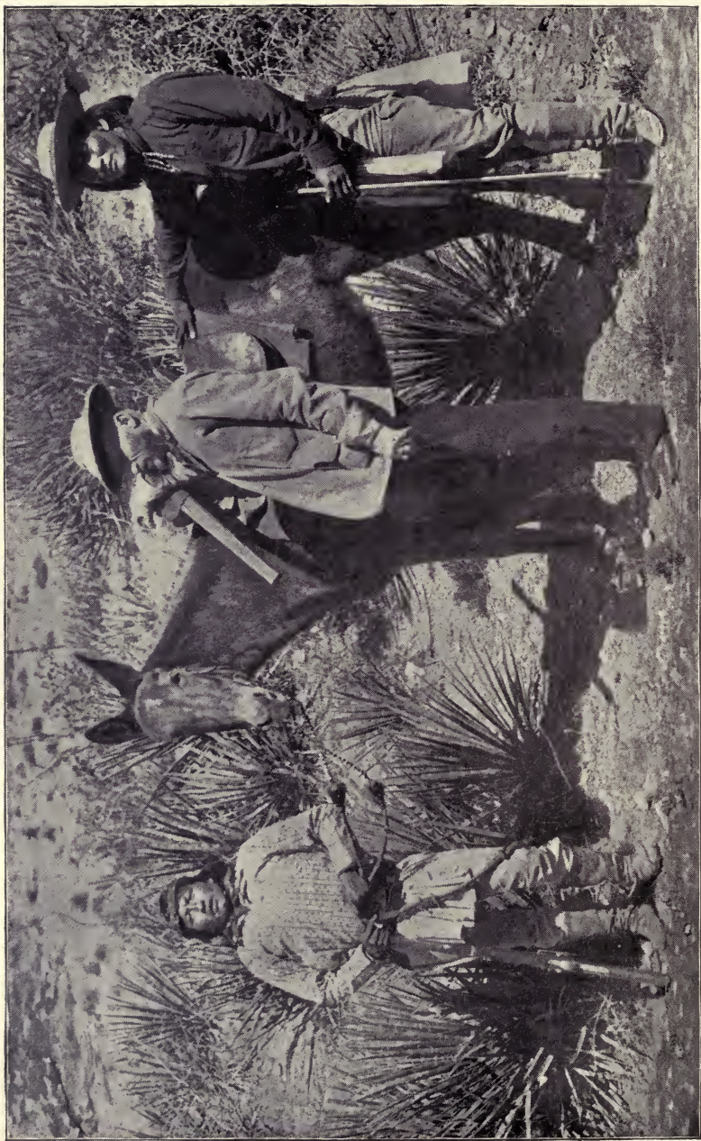
GENERAL CROOK AND THE FRIENDLY APACHE, ALCHISAY.