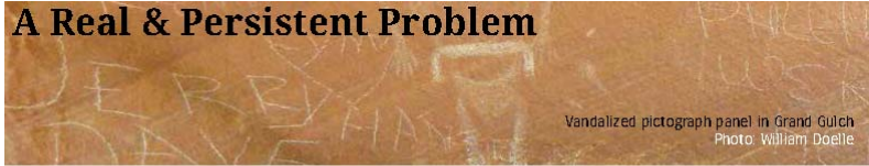
Vandalized pictograph panel in Grand Gulch

Between October 2011 and June 2016, the Bureau of Land Management Monticello Field Office investigated at least 28 incidents of looting, vandalism and serious damage to archaeological sites in San Juan County. Those are the incidents the BLM is aware of on lands it manages and does not include incidents on Forest Service, Park Service and State Trust lands.