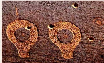
Bullet holes in petroglyph panel in Butler Wash

Vandalism on our public lands can take many forms, such as intentionally knocking down walls of prehistoric structures, burning historic hogans, self-congratulatory graffiti on rock art, and using petroglyph panels for target practice. Intentionally irresponsible off-road vehicle driving can also cause significant damage to cultural sites.