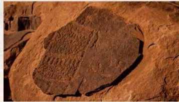
Petroglyph marred by attempted theft with rock saw and chisel.