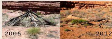
Hogan destroyed for campfire.