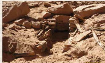
Looted burial site in Cottonwood Canyon

Desecration of burials is the most disturbing form of looting. "Grave robbers" dig up burial sites to look for grave goods like ceramics that were buried with the deceased. Grave robbing is a personal affront to modern day Native American descendants.