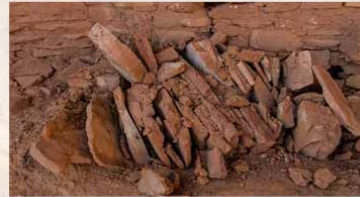
Wall knocked down by careless visitor or possibly a cow.

Careless visitation by uneducated hikers presents a constant threat to sacred sites in the Bears Ears region. Unsupervised children climb on walls, ignorant visitors pocket 1,000 year-old pot sherds, unleashed dogs create erosion around architectural features, fires in alcoves obscure rock art, wannabe ancients grind away prehistoric grinding slicks, and even hiking poles scar surface rock art.