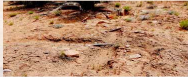
Looter trenches at pithouse site on Cedar Mesa.

Between October 2011 and June 2016, the Bureau of Land Management Monticello Field Office investigated at least 28 incidents of looting, vandalism and serious damage to archaeological sites in San Juan County. Those are the incidents the BLM is aware of on lands it manages and does not include incidents on Forest Service, Park Service and State Trust lands.