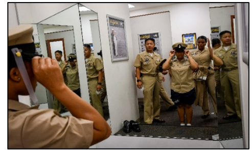
FY-19 CPO Selectees Uniform Fitting.

As we welcome the newest Chiefs into the ranks, it is important for all Chiefs to be knowledgeable of CPO uniform allowances (Initial and Replacement) and clothing requirements. Starting with the Special Initial Clothing Allowance (SICA), it is paid to Active, FTS and Selected Reserve Chiefs to obtain required clothing of CPOs. It is paid upon official advancement to the rank of Chief Petty Officer and not when frocked (Ref: DoD Financial Management Regulation Vol. 7A, Chapter 29). The SICA rate for FY2019 is $1,042.75 for males and $1,075.87 for females. SICA is subject to change on 1 October of each fiscal year to align with the new fiscal year's clothing costs and requirements.