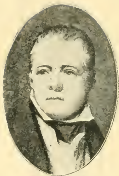
SIR WALTER SCOTT