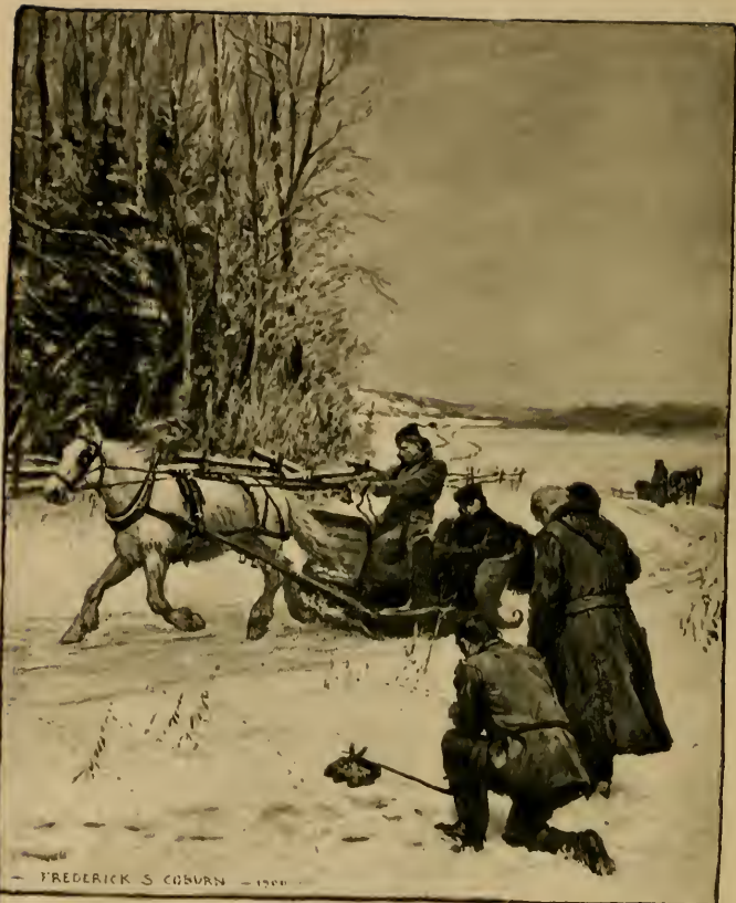
FREDERICK S. COBURN - 1900