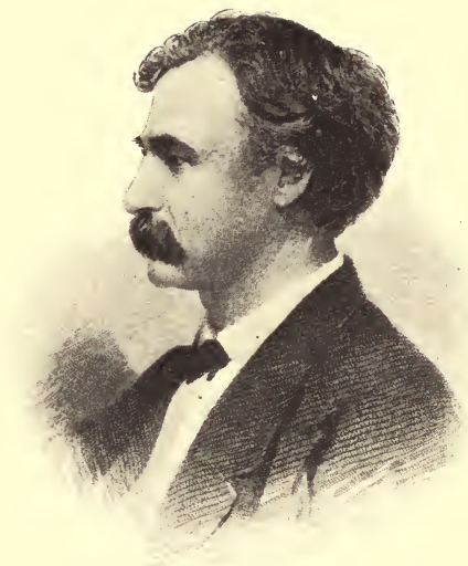
HENRY WINTER DAVIS