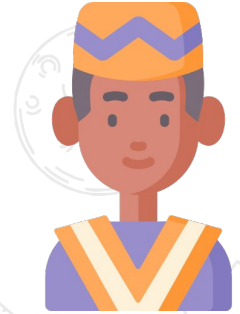
Africa Youth Day

In line with the WikiVibrance scope, we are focusing on one of the Africa Union (AU) holidays...Africa Youth Day under The Africa Knowledge Initiative and Agenda 2063 for this year. Africa Youth Day among two others have been strategically selected because of their ability to engage a wide variety of African audiences and also the need to grow the capacity of knowledge producers over time.