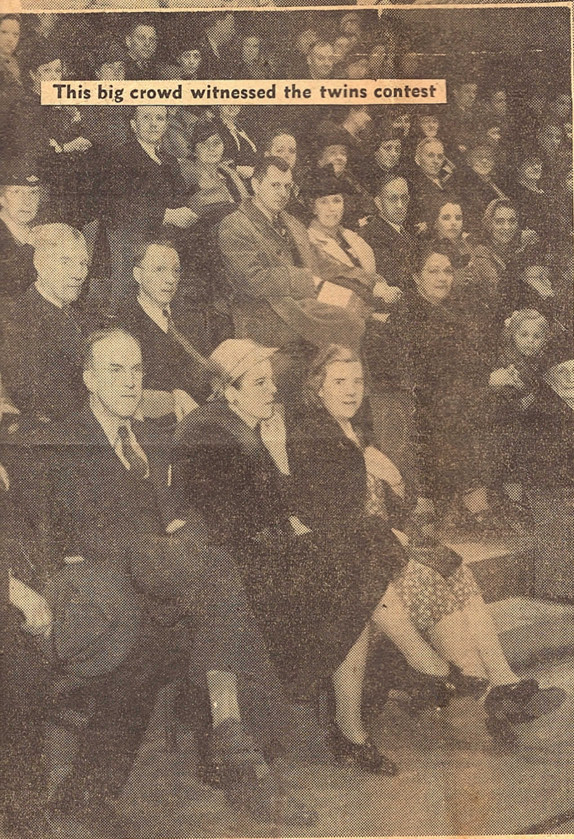
This big crowd witnessed the twins contest