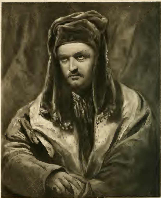
Macready in the character of Henry IV