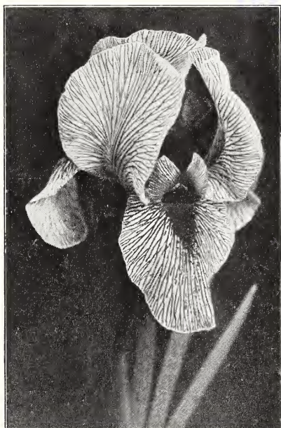
REGELIO-CYCLUS IRIS "ANDROMACHE."