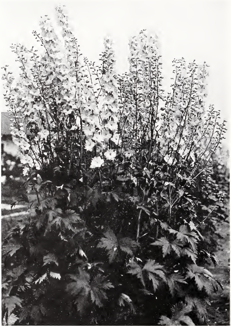
A FINE SPECIMEN PLANT OF PUDOR'S "GLORY OF PUGET SOUND" HARDY DELPHINIUM STRAIN

Have you a copy of my Hardy Plant and Seed Catalog? It's free.