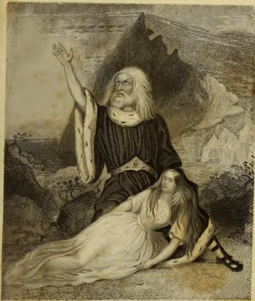
MR. MACREADY AS KING LEAR.