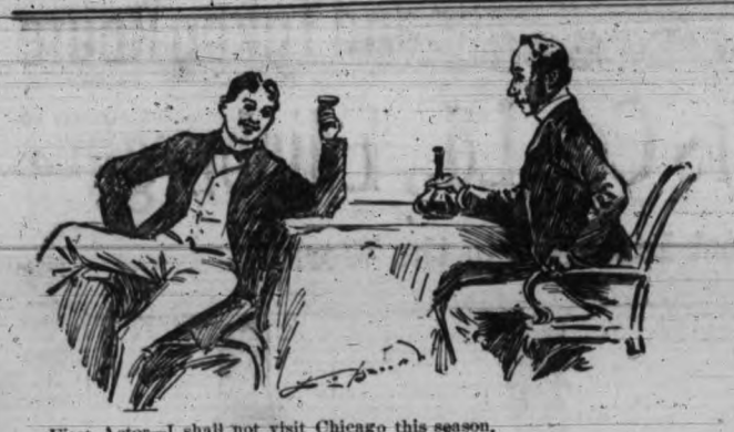
First Actor—I shall not visit Chicago this season, Second Actor—Why not? First Actor—Well, I hear that there is a billion