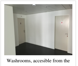
separted entrace room