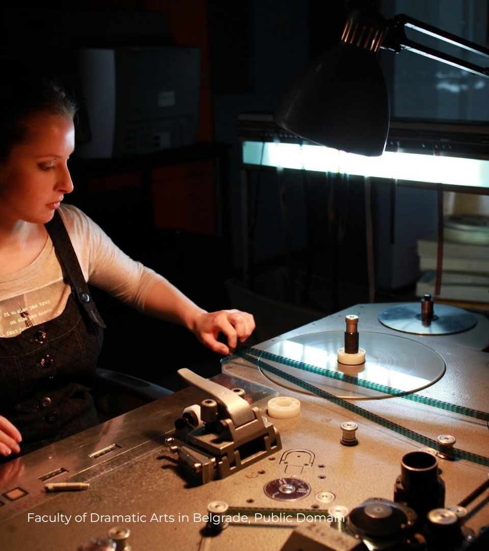
Faculty of Dramatic Arts in Belgrade, Public Domain