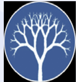
Open Source Schools

This presentation is CC-BY-SA except for logos and screenprints which are Fair Use or used with permission