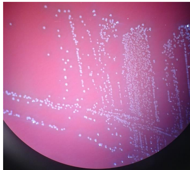
Figure 1 | Blood agar with alpha hemolytic colonies following culture from the patient's blood samples.

mg/l (normally less than 5 [4] or 6 [5] ) and a leukocyte count of 13.7*10 9 /l (normally less than 9.0 [6] or 10.0 [7] ). The patient was admitted to the hospital for observation, and after one day on the ward he developed chills and was subfebrile with a tympanic body temperature of 37.6°C (normally up to 37.5°C). [8] Blood and urine samples were taken for culture. Microscopy of the blood samples showed gram-positive cocci. The patient received intravenous cefotaxime . After three days all blood samples and urine samples showed growth of gram-positive catalase-negative cocci Aerococcus urinae ( Figures 1 and 2 ).