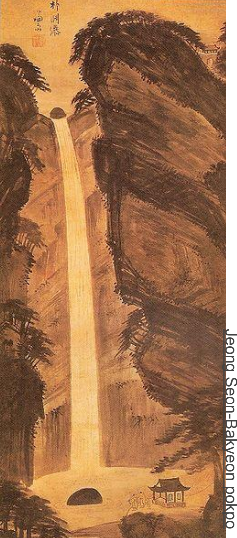
Jeon Seon-Bakjeon pokpo